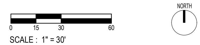
1 SITE PLAN- AREA 1 1" = 30'-0"