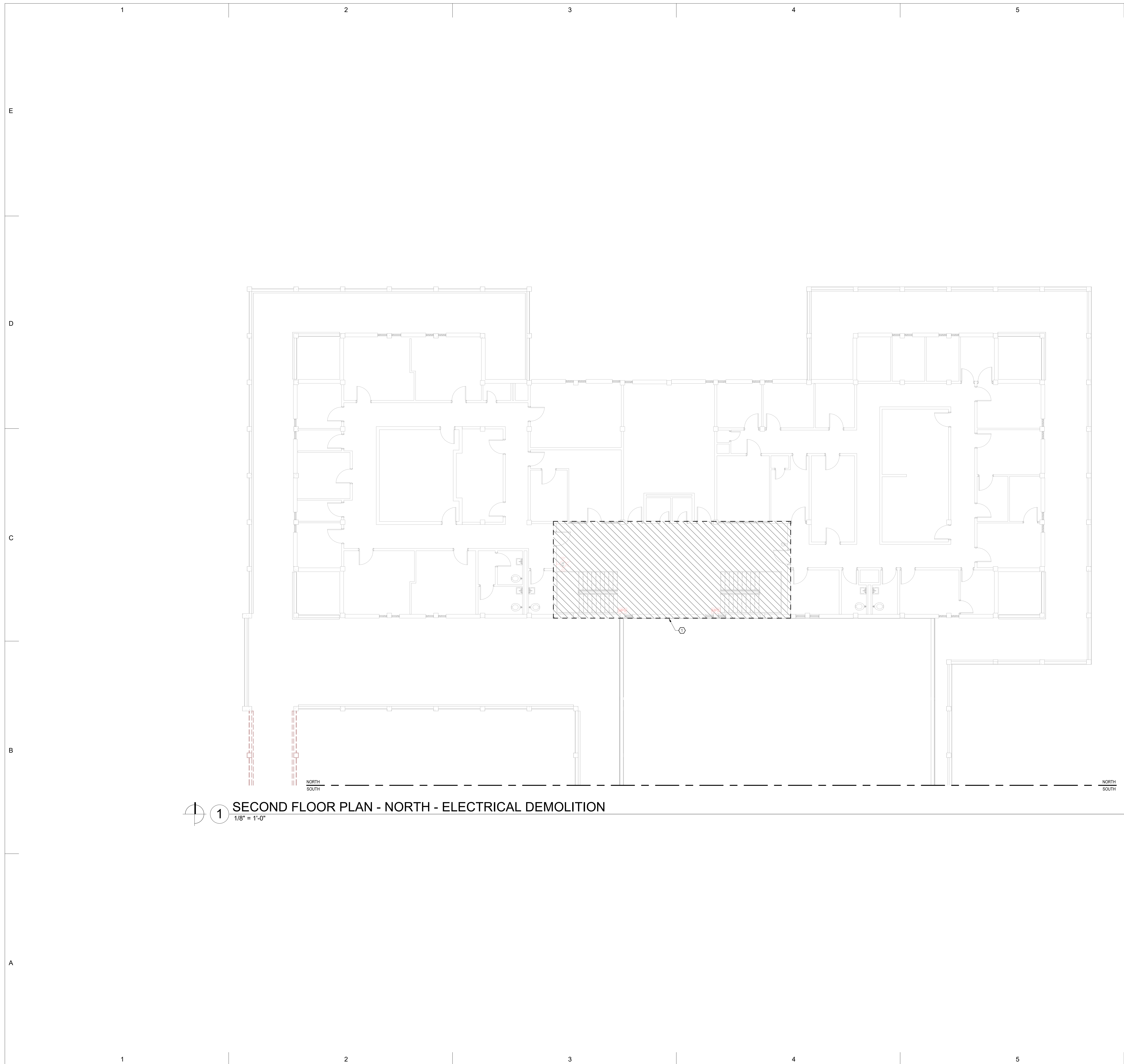
1 SECOND FLOOR PLAN - NORTH - ELECTRICAL DEMOLITION 1/8" = 1'-0"