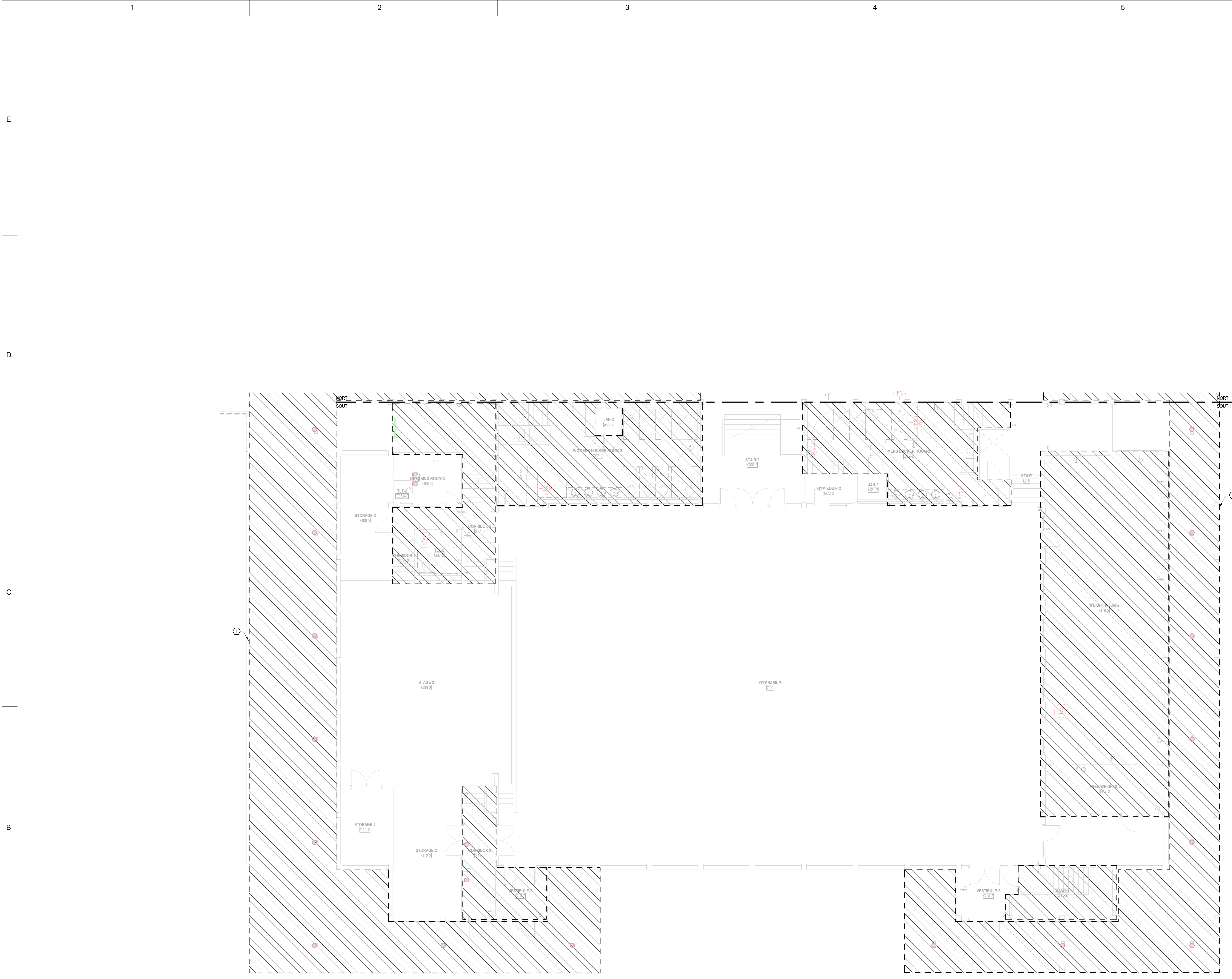
1 GROUND FLOOR PLAN - SOUTH - ELECTRICAL DEMOLITION 1/8" = 1'-0"