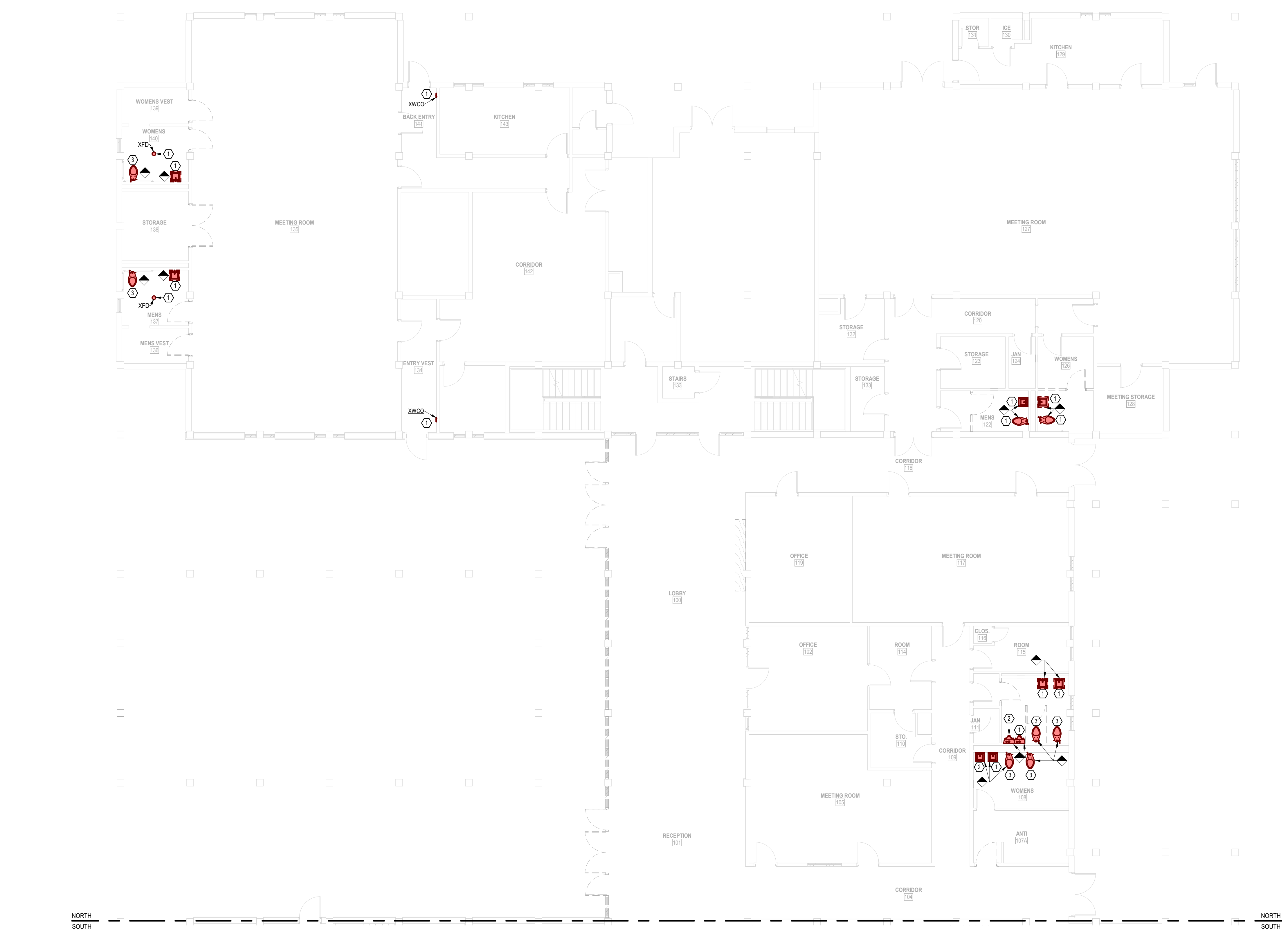
1 GROUND FLOOR PLAN - NORTH - PLUMBING DEMOLITION 1/8" = 1'-0"