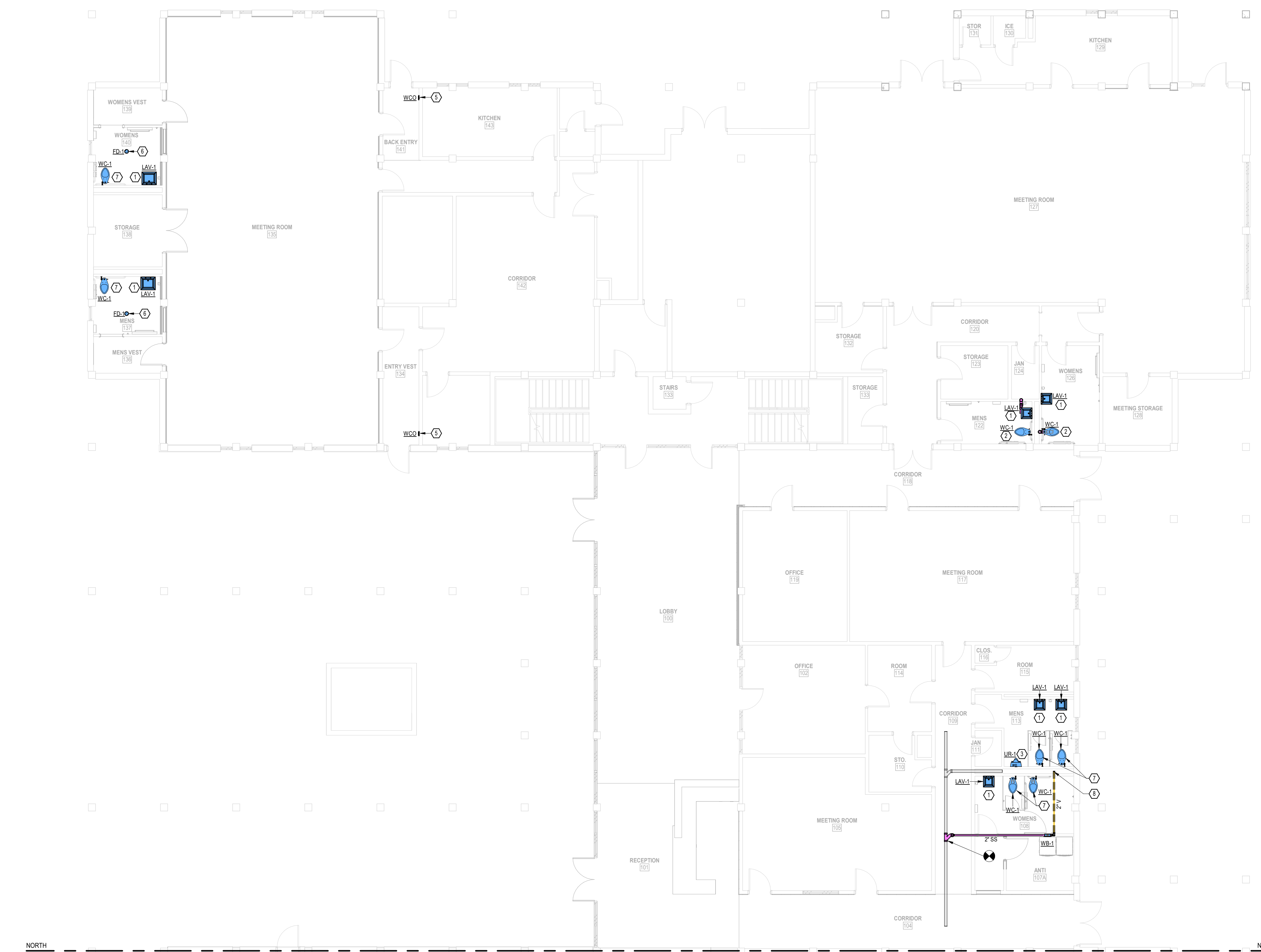
1 GROUND FLOOR PLAN - NORTH - SANITARY SEWER 1/8" = 1'-0"