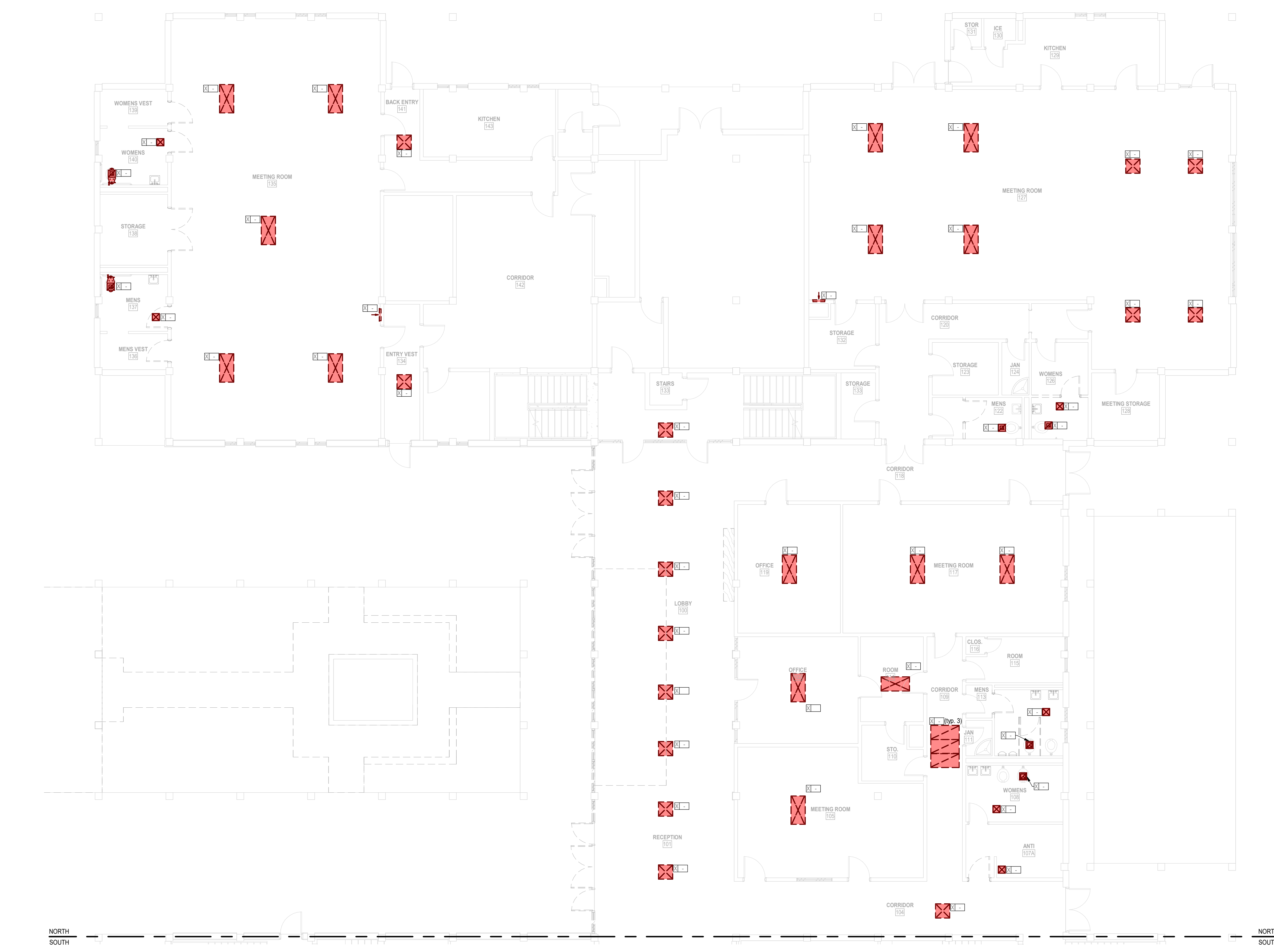
1 GROUND FLOOR PLAN - NORTH - HVAC DEMOLITION 1/8" = 1'-0"