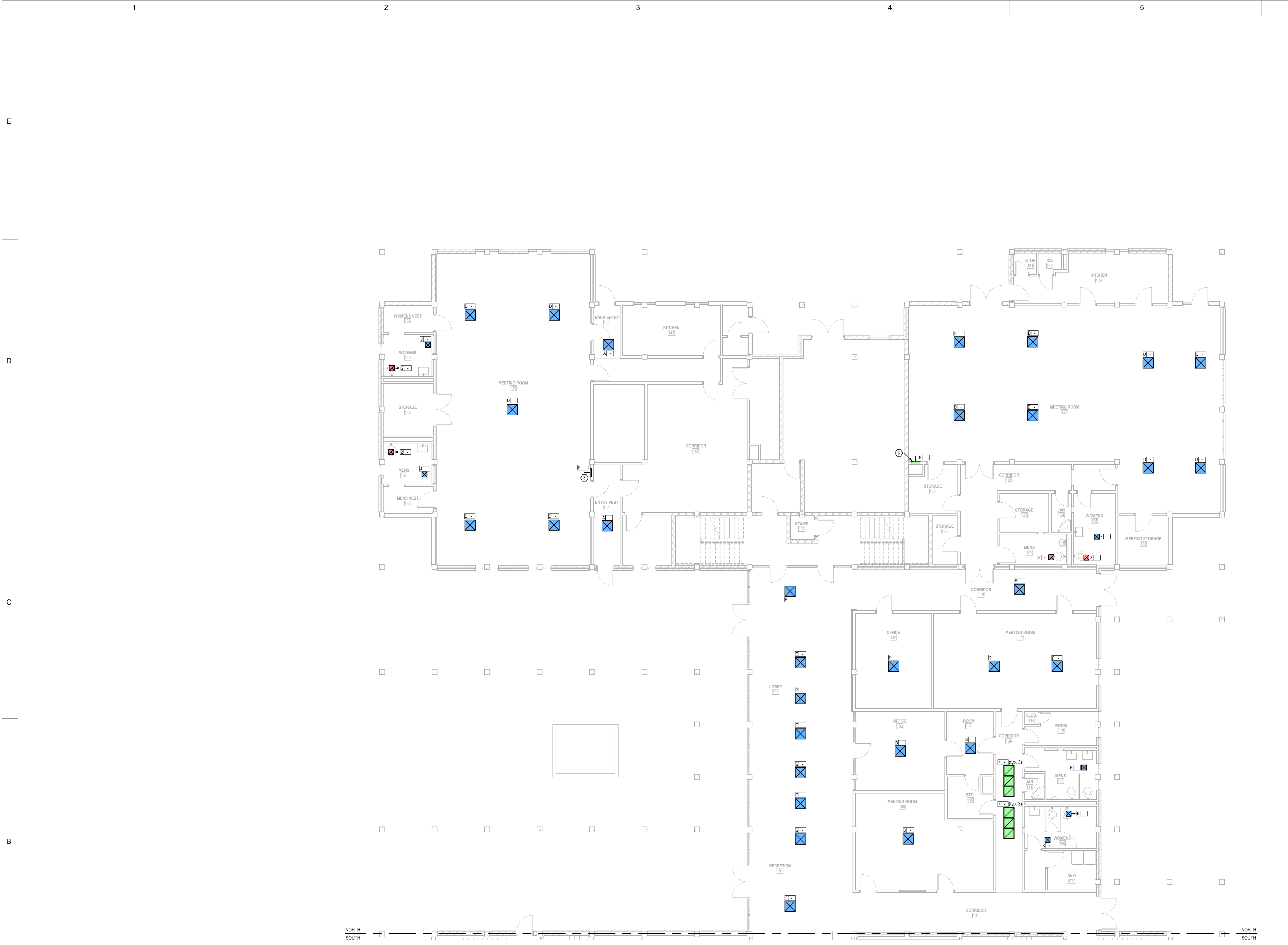
1 GROUND FLOOR PLAN - NORTH - HVAC 1/8" = 1'-0"