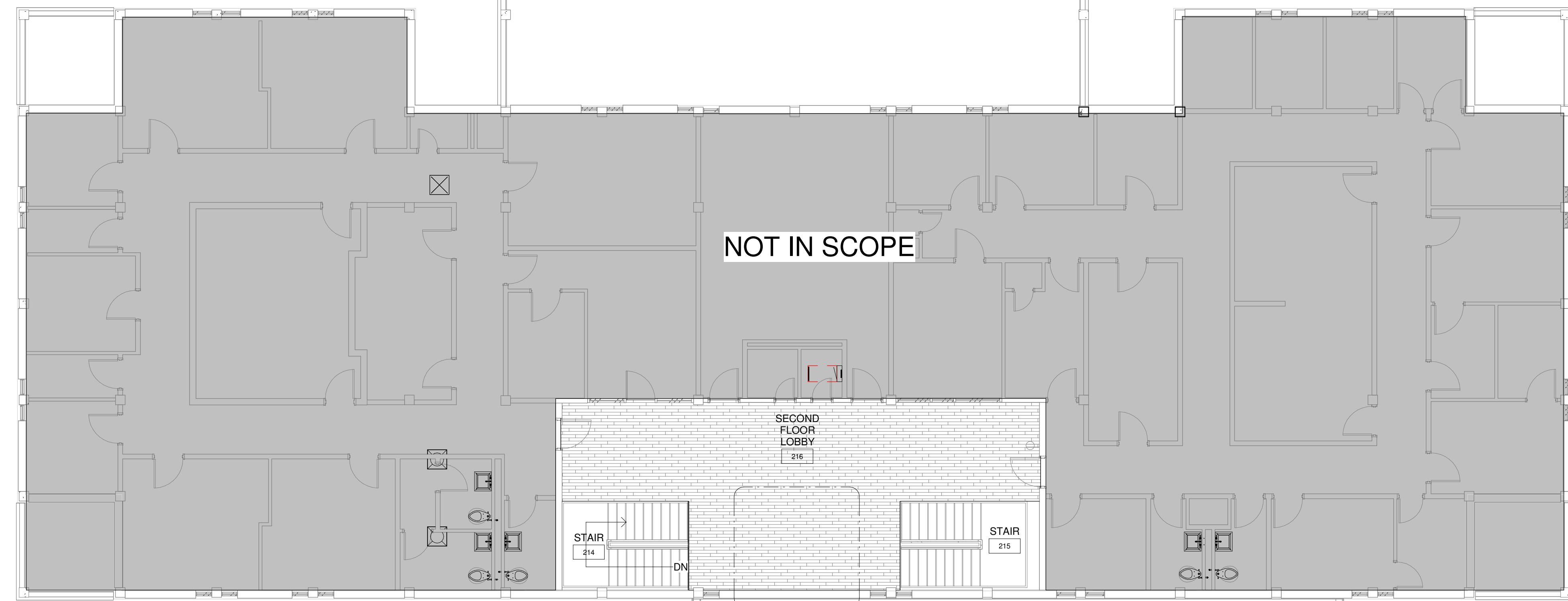
2 SECOND FLOOR FINISH PLAN - NORTH 1/8" = 1'-0"