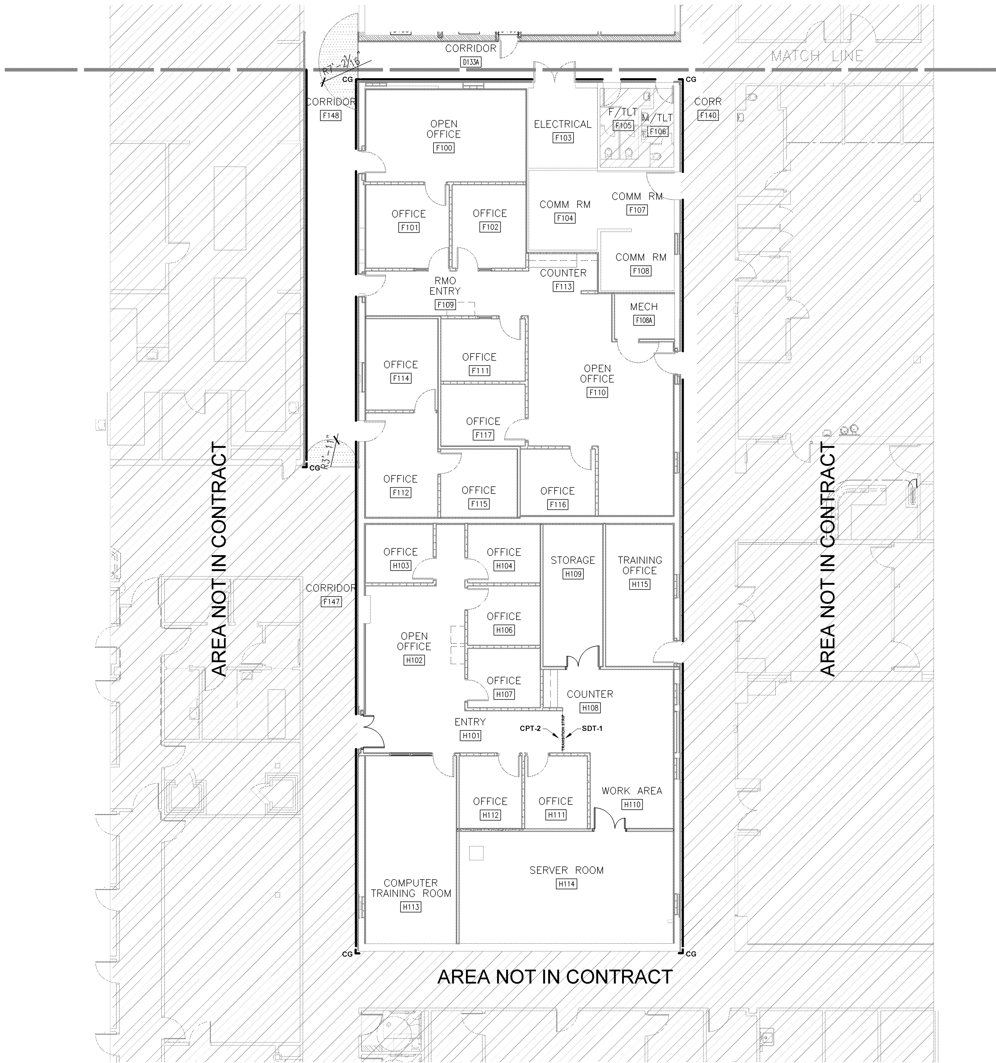
1 WALL PROTECTION & FLOOR PATTERN PLAN – AREA "B" 1/8"=1'-0"

REFER TO A-601 FOR ALL WALL SPECIFICATIONS