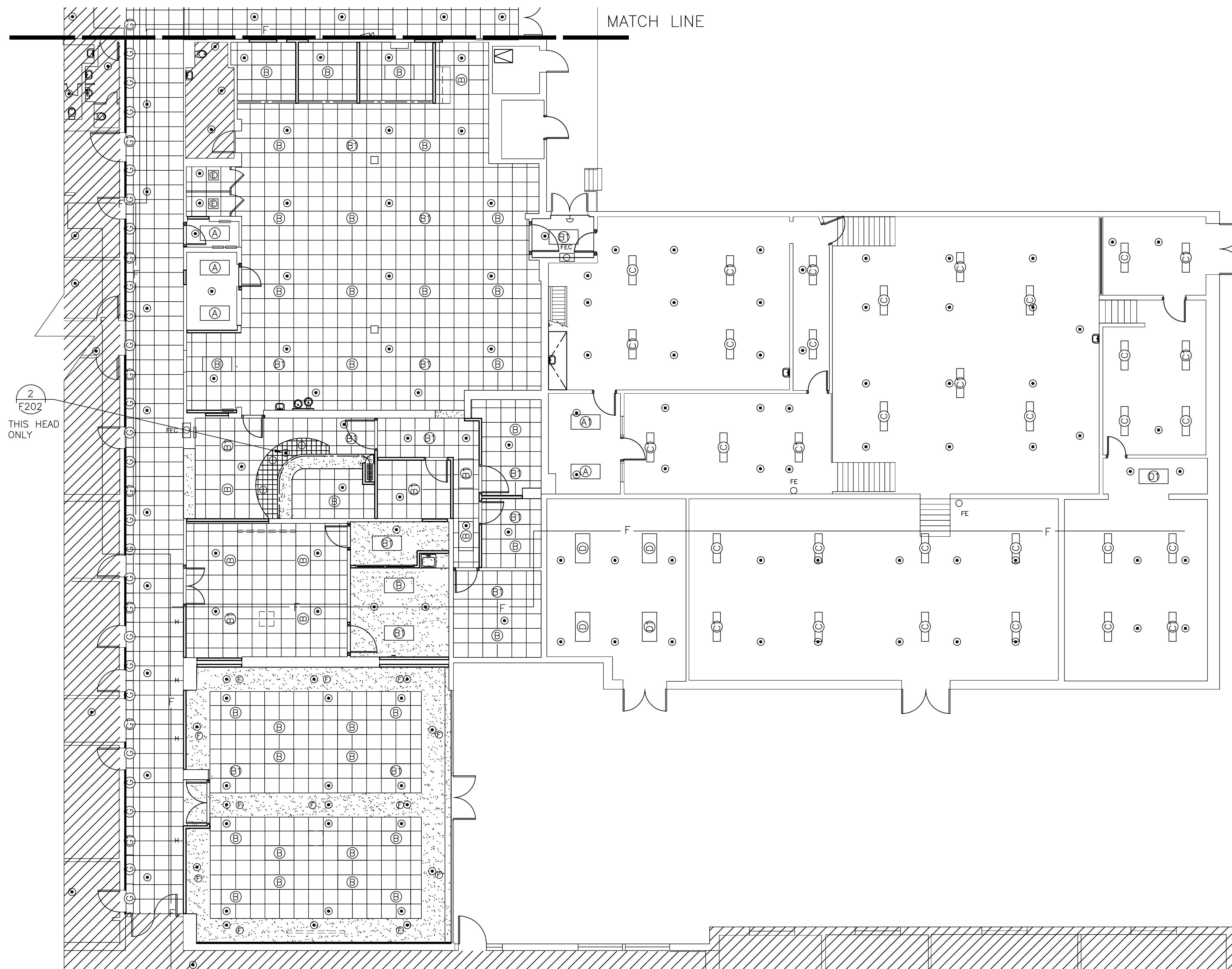
1 FIRE PROTECTION INSTALLATION PLAN AREA "B" SCALE: 1/8" = 1'-0"