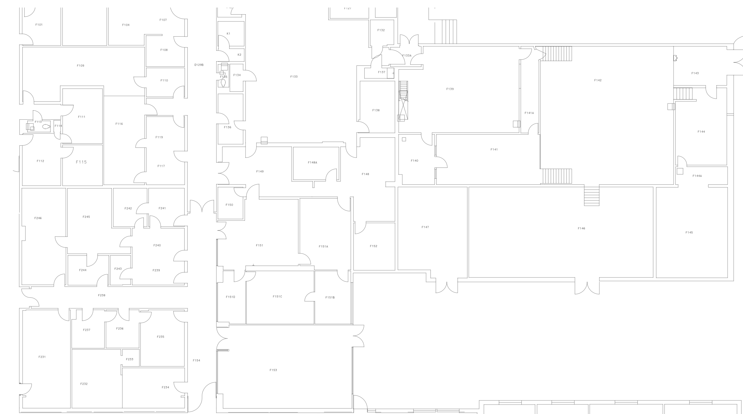
1 PARTIAL PLAN OF AREA 'F' IN ZONE A