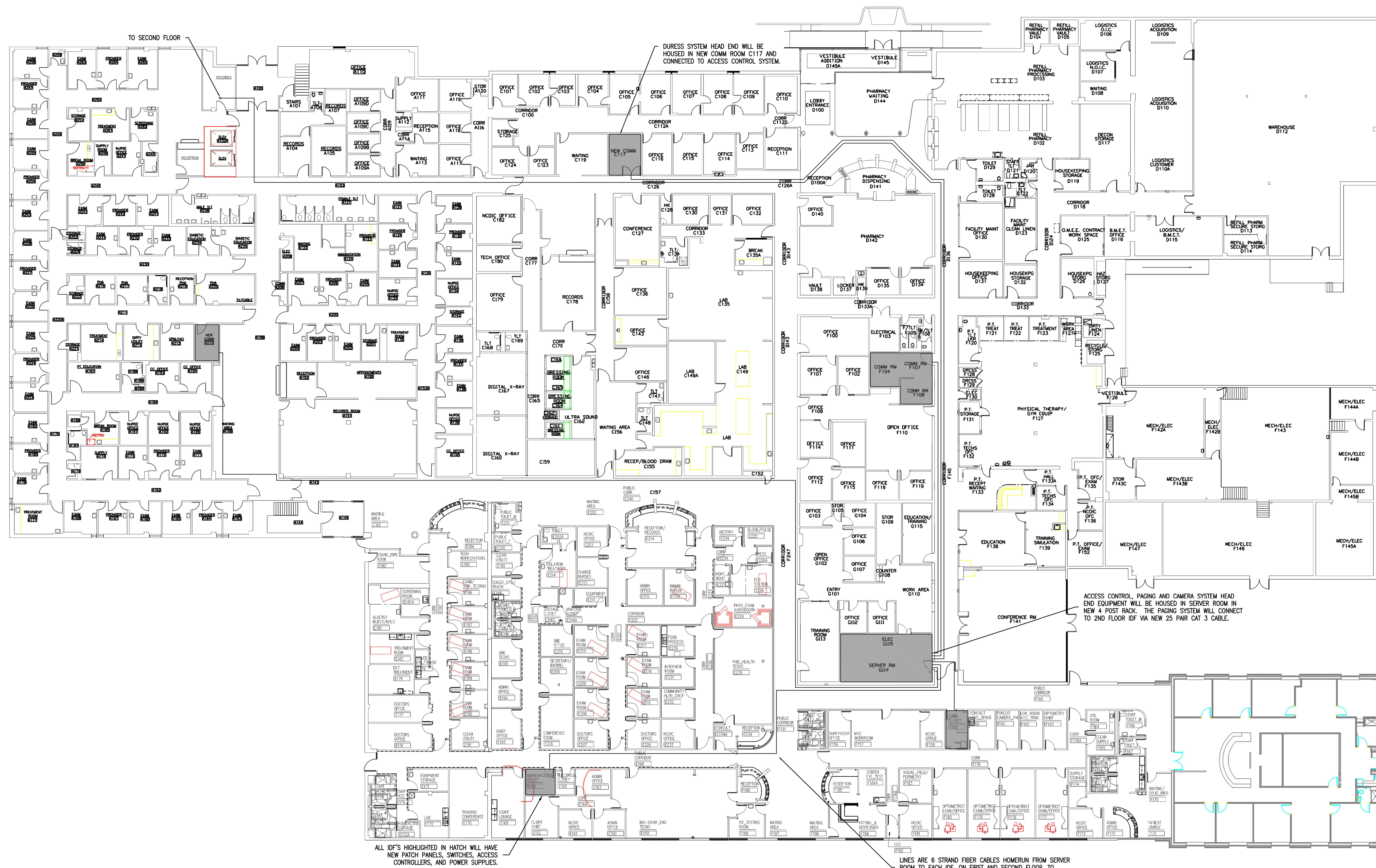
1 FIRST FLOOR - PHASE 1 - FIBER INFRASTRUCTURE PLAN SCALE: 1/16" = 1'-0"