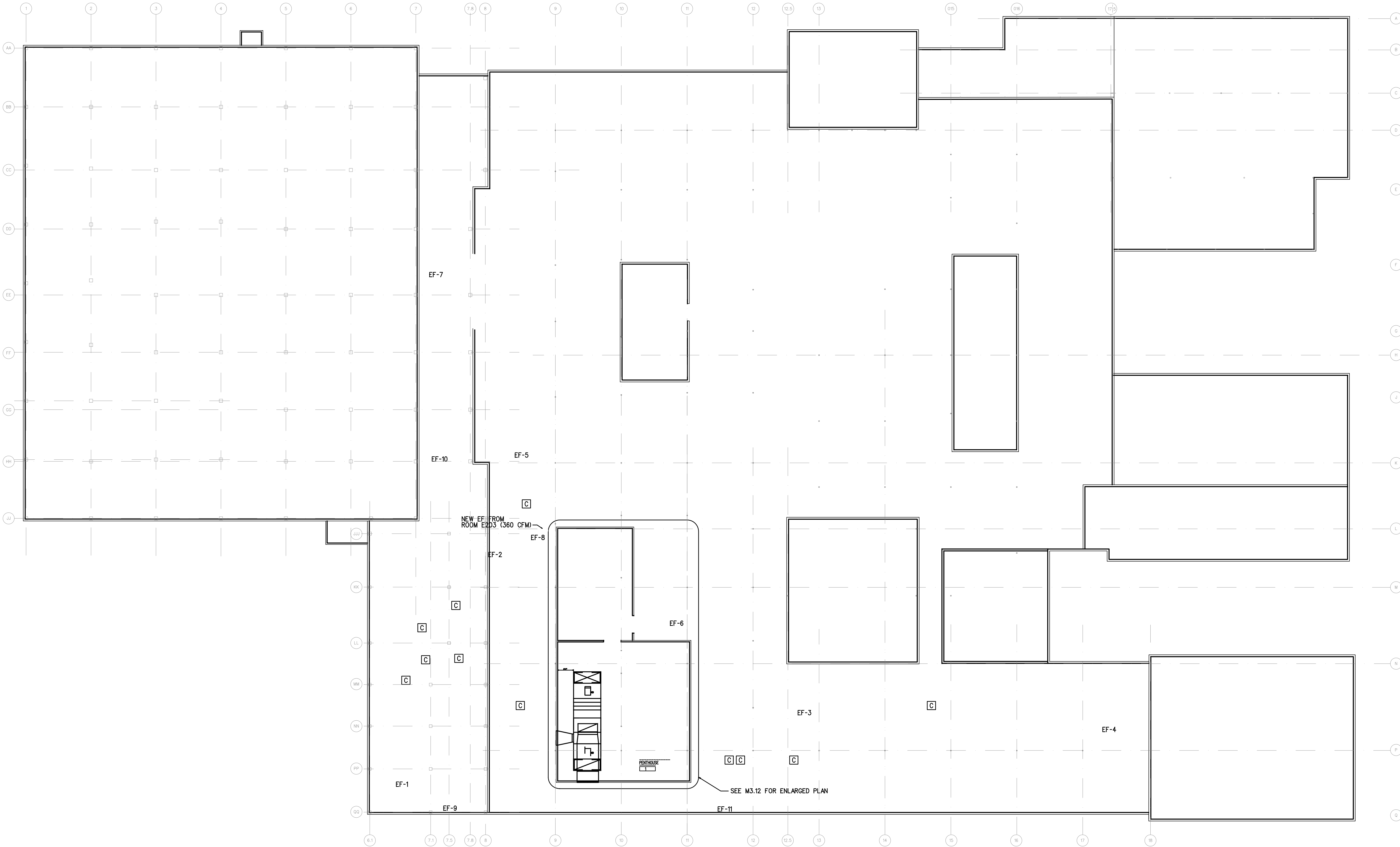
1 ROOF PLAN