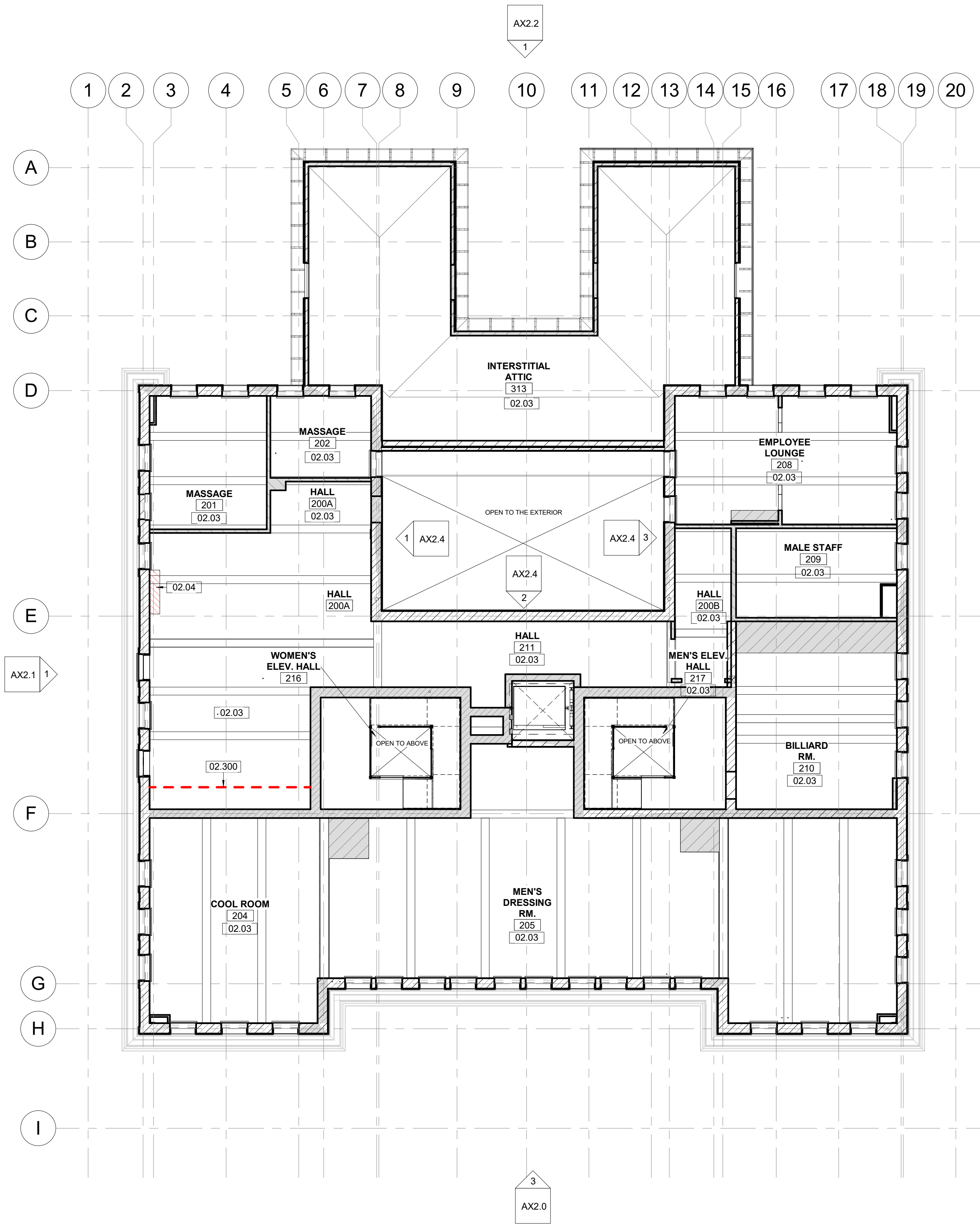
1 Demolition Second Floor Reflected Ceiling Plan AX1.22 1/8" = 1'-0" SCALE (A)