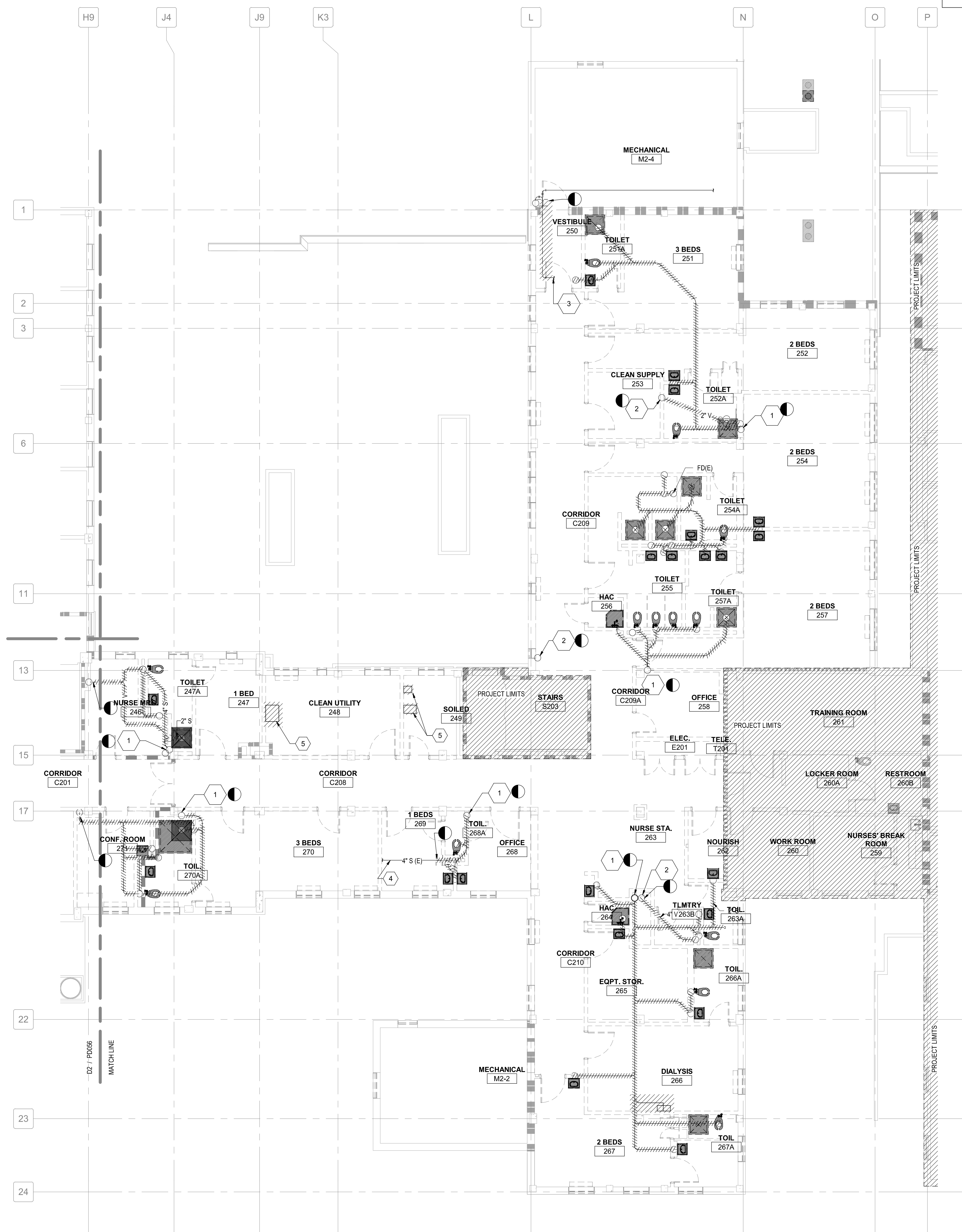
D3 PARTIAL 2B SECOND FLOOR DEMOLITION WASTE PLAN - PHASE 1 1/8" = 1'-0"