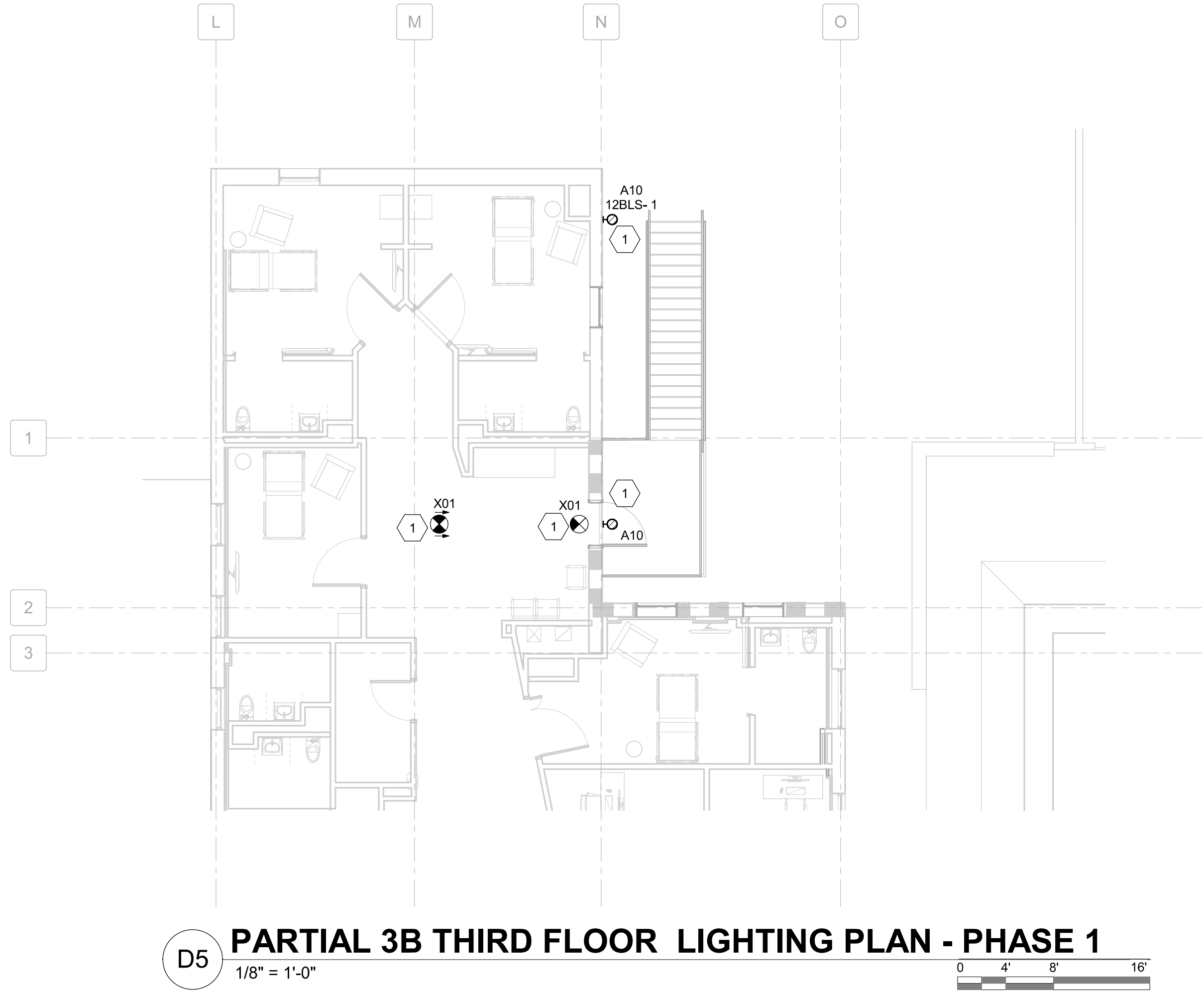
PARTIAL 3B THIRD FLOOR LIGHTING PLAN - PHASE 1 1/8" = 1'-0"