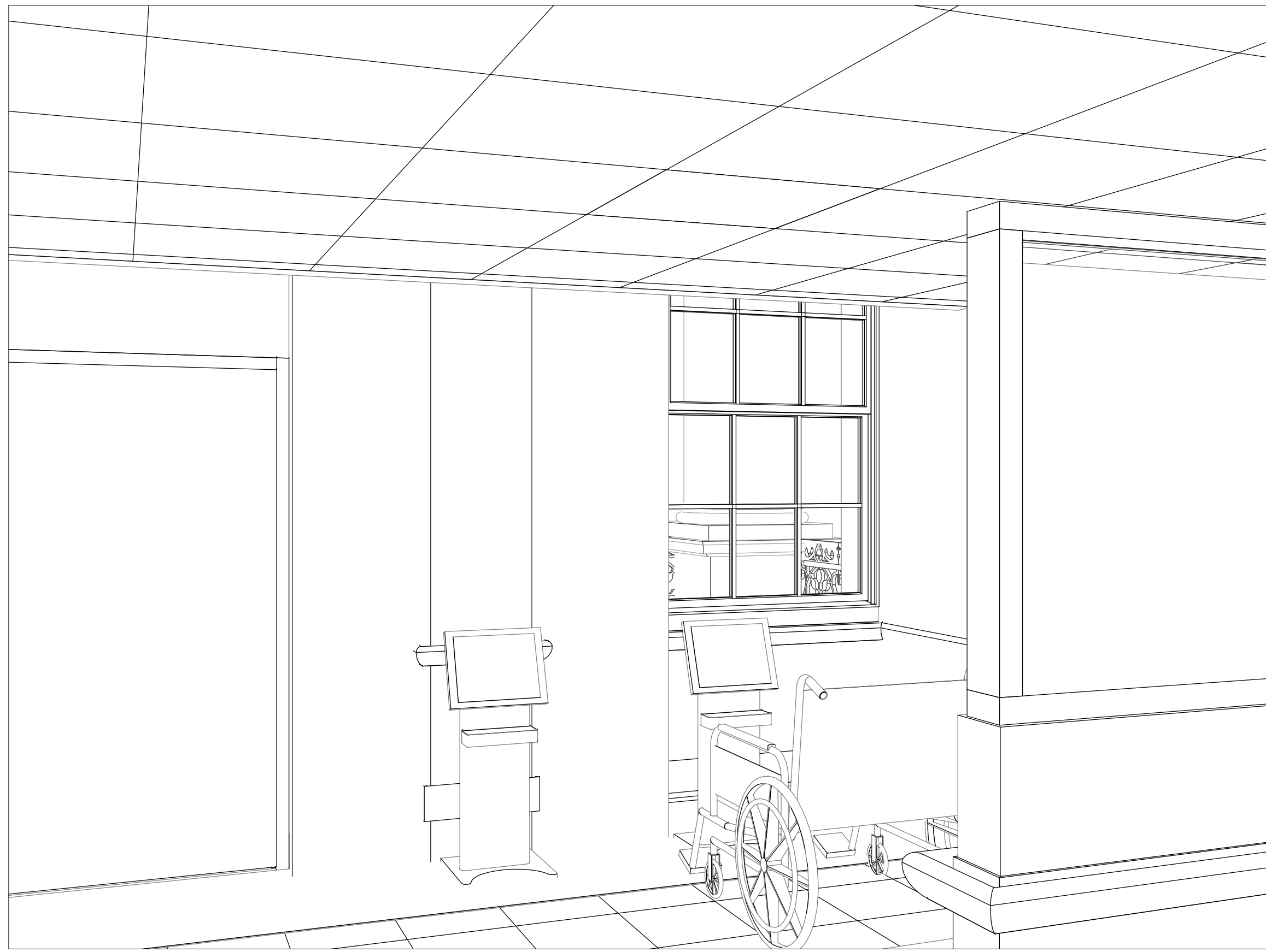
B1 3D VIEW AT KIOSK STATION