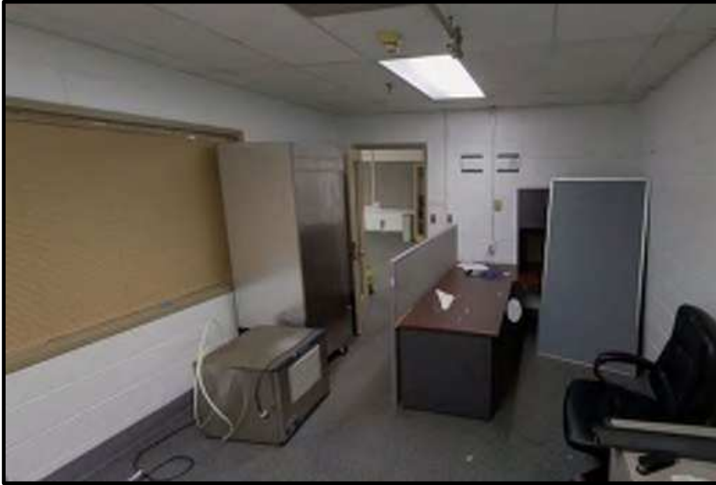
85 - B216 NW Secure Area AIS Shop