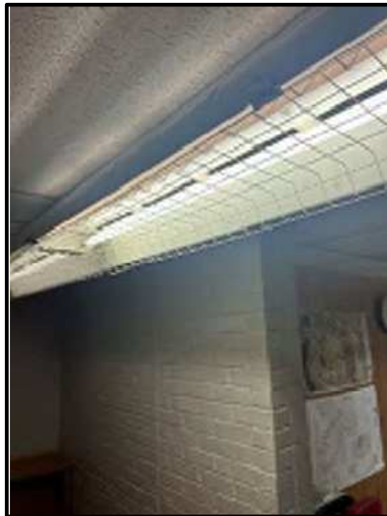
14 - B201 Hallway Light