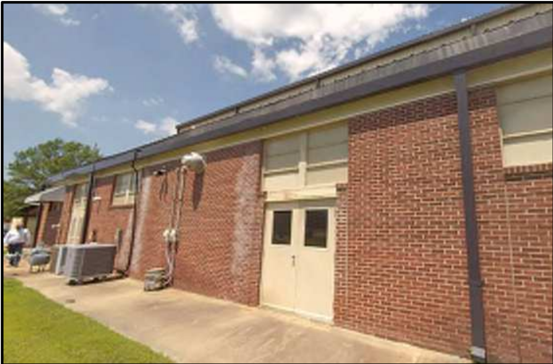
56 - B214 Exterior View #2