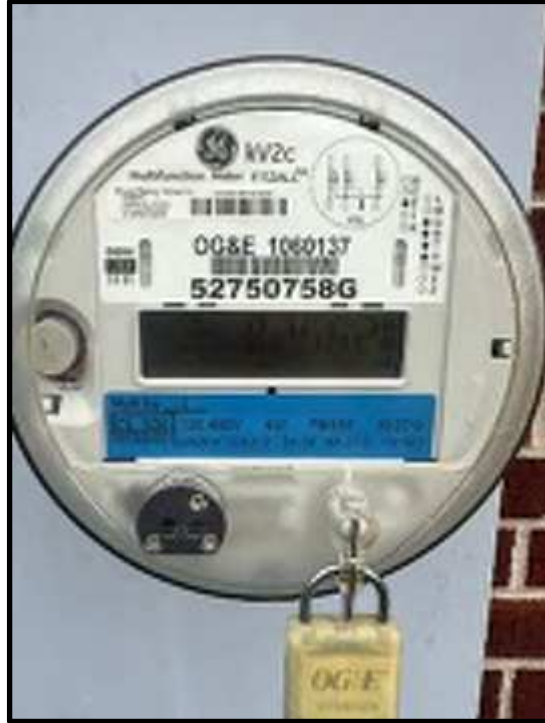
13 - B201 Meter