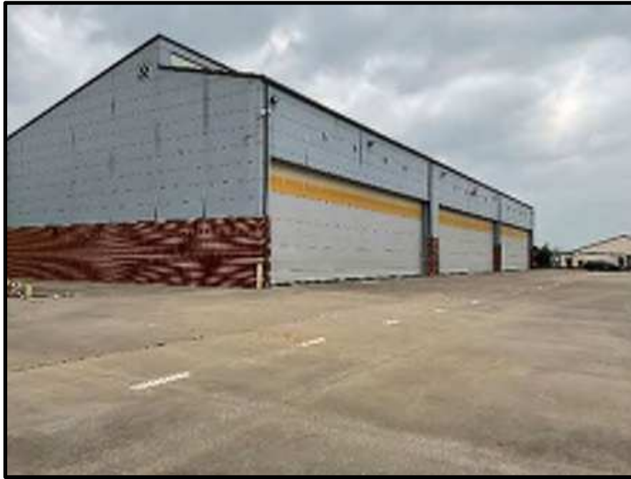
17 - B202 Flightline Facade