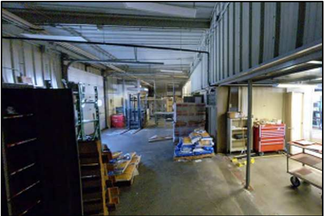
70 - B214 Storage Area #2