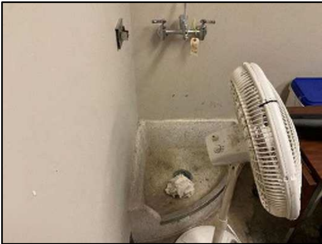
34 - B202 Existing Service Sink