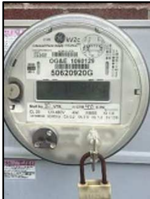
60 - B214 Meter