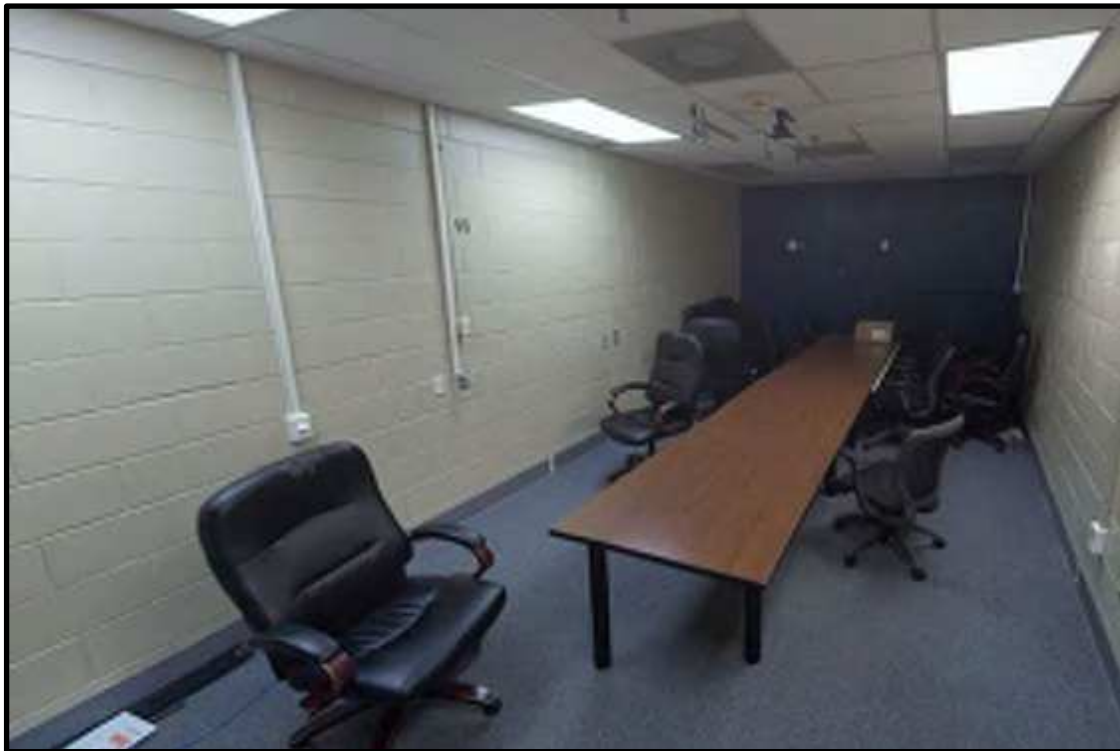
88 - B216 NW Secure Area VTC Conference Room