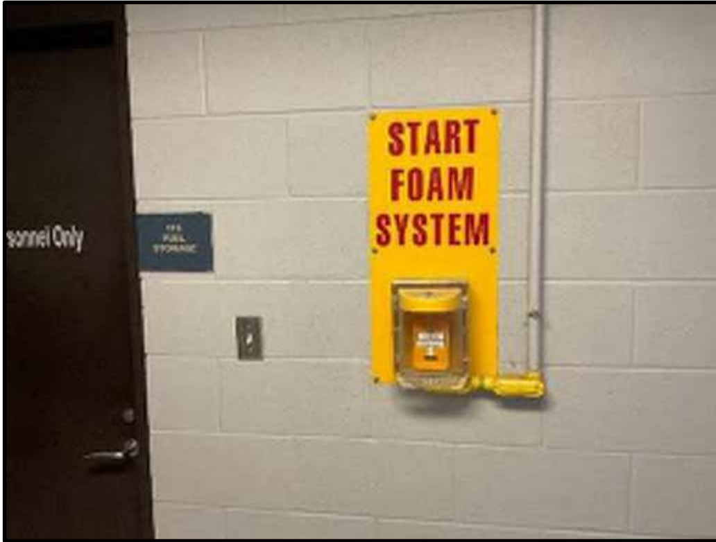
54 - B202 Foam Suppression System