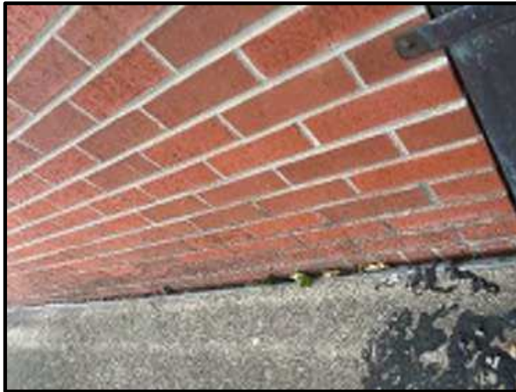
79 - B216 Expansion Joint