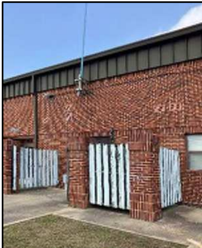
8 - B201 Utility Enclosure #2