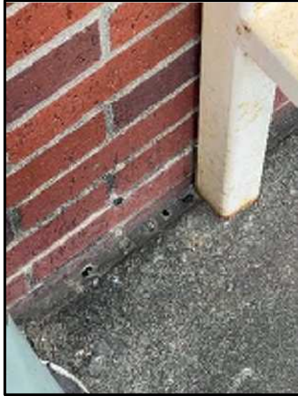
52 - B202 Expansion Joint