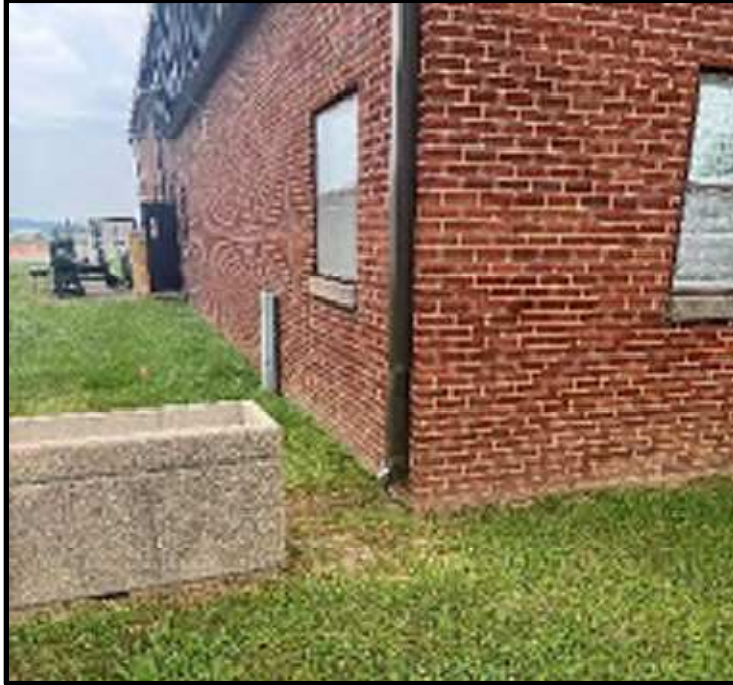
9 - B201 Downspout with No Splash Block