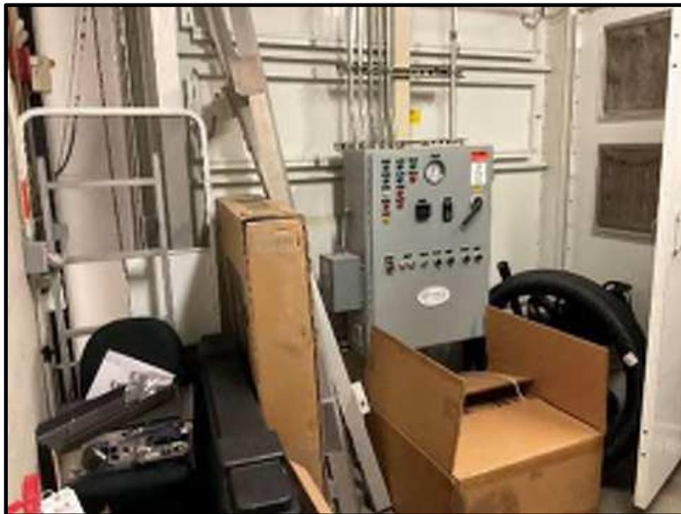
46 - B202 Paint Booth