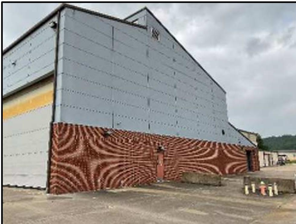
26 - Southeast Corner