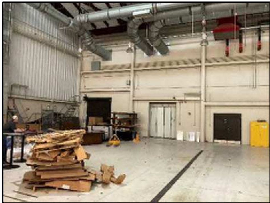
44 - B202 Hangar Bay 3 North Wall West Side