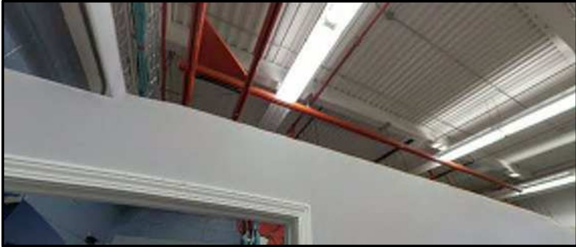
81 – B216 F35 Area Crane