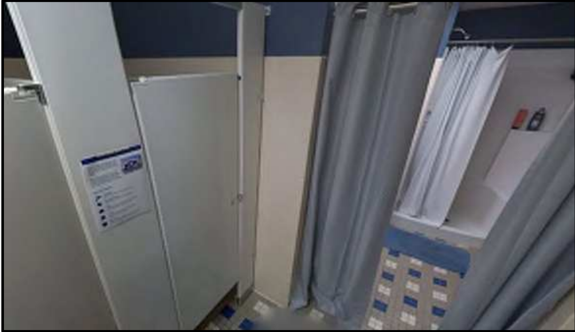
106 - B218 Restroom