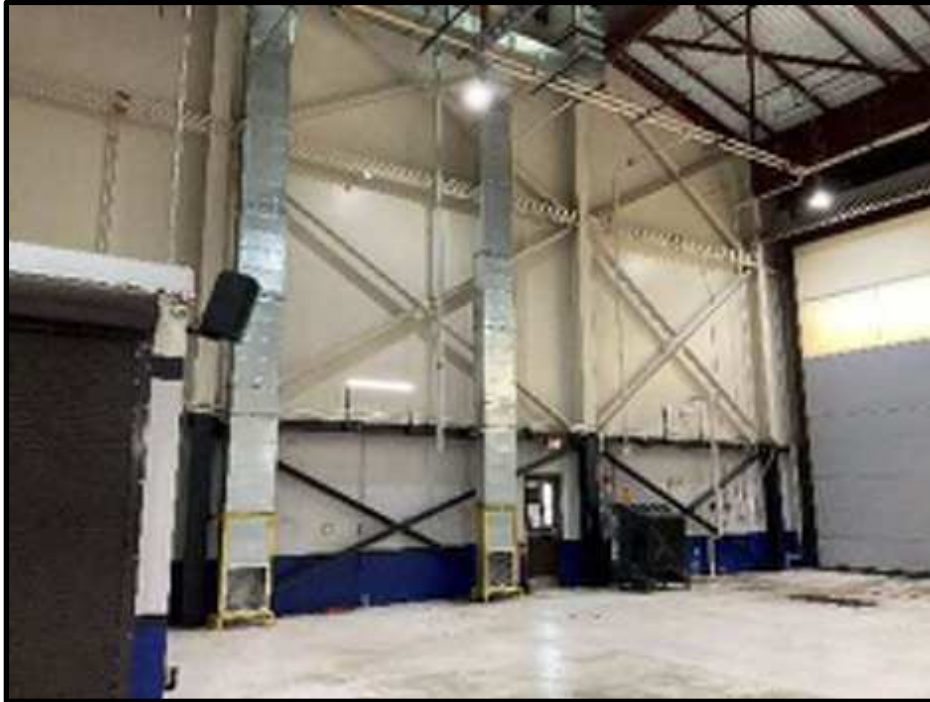
39 - B202 Hangar Bay 1 East Wall (Door to be Removed)