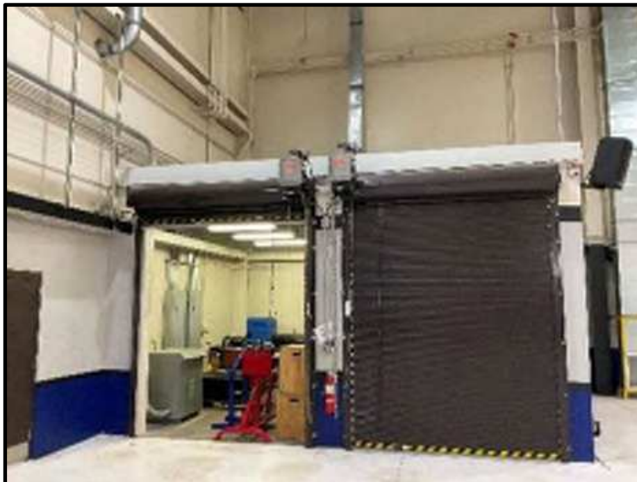
40 - B202 Hangar Bay 1 Storage Rooms