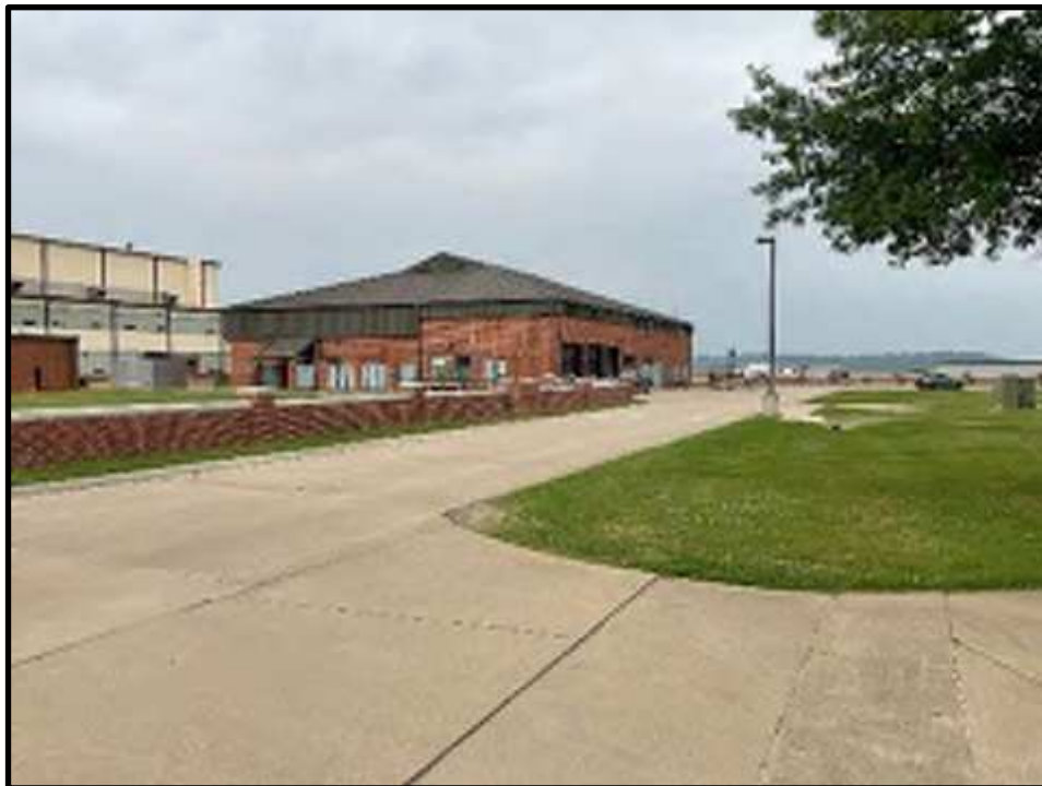
2 - B201 Exterior from Southeast