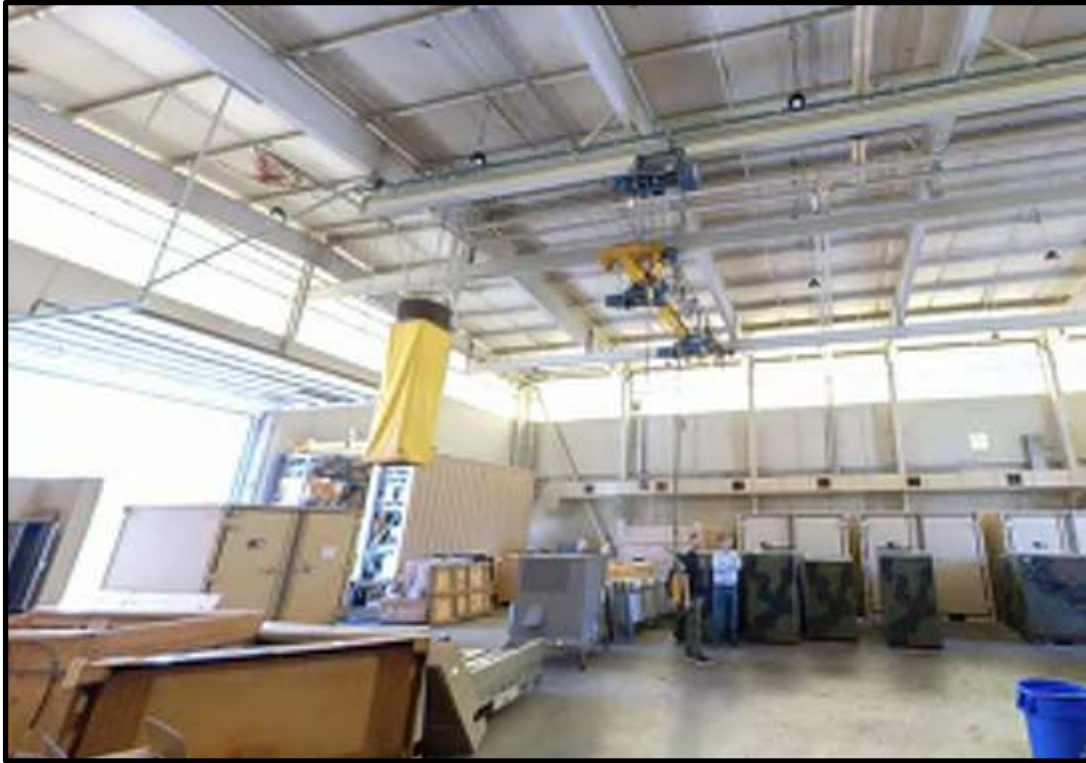
75 - B214 Work Bay View #3