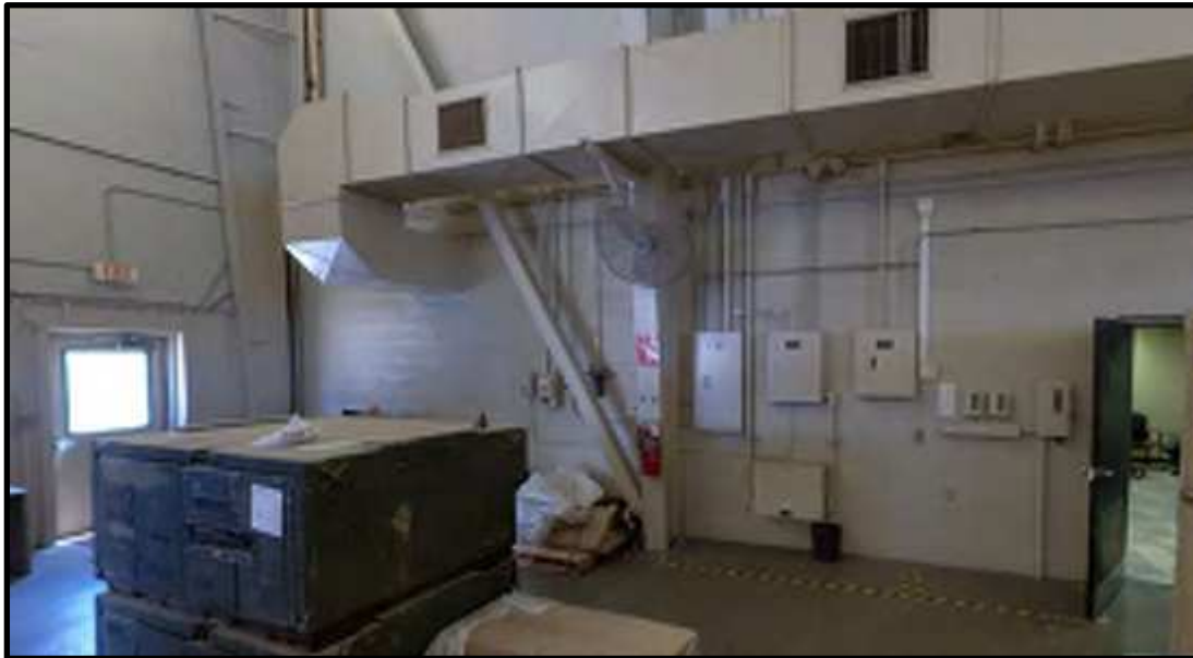
76 - B214 Work Bay View #4