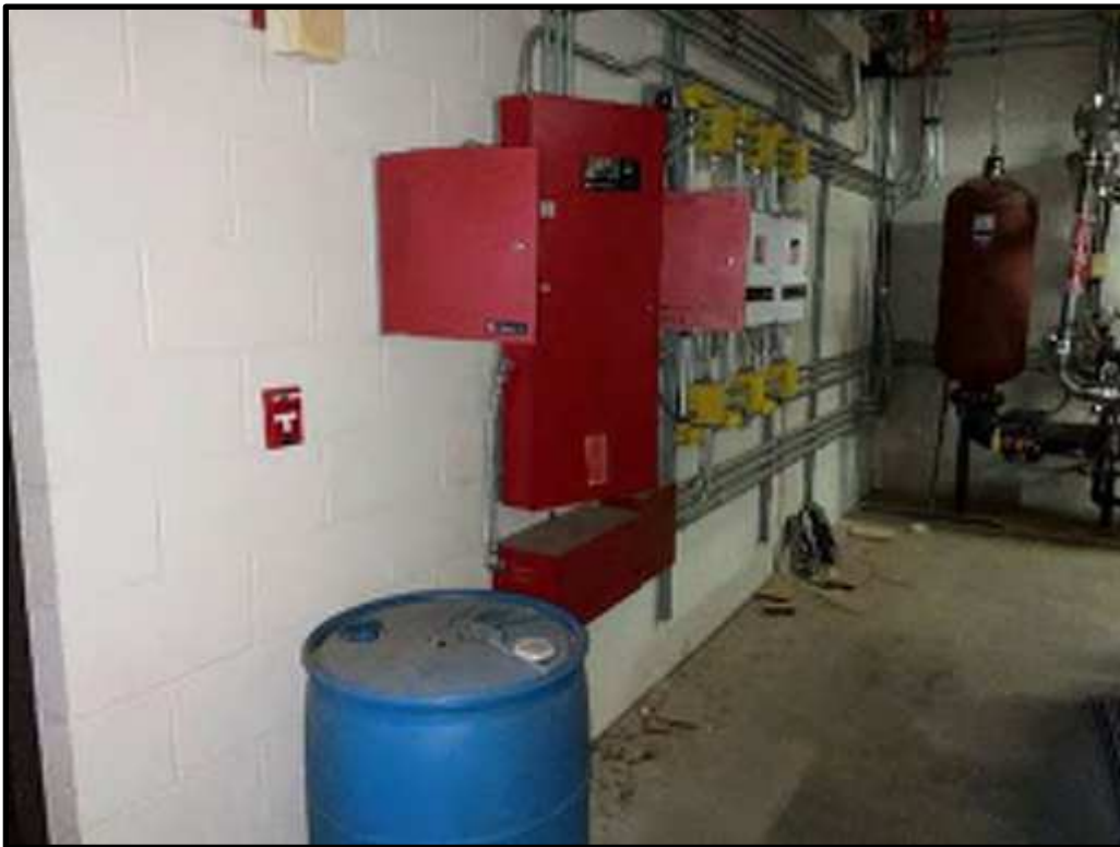
36 - B202 Fire Riser Equipment