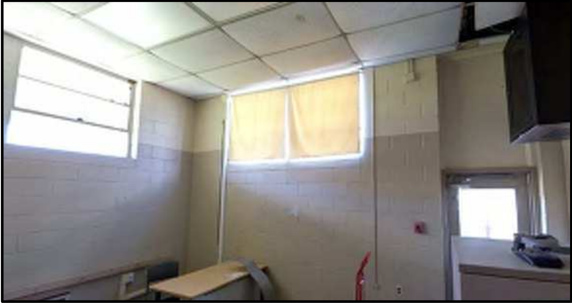
65 - B214 Existing Office