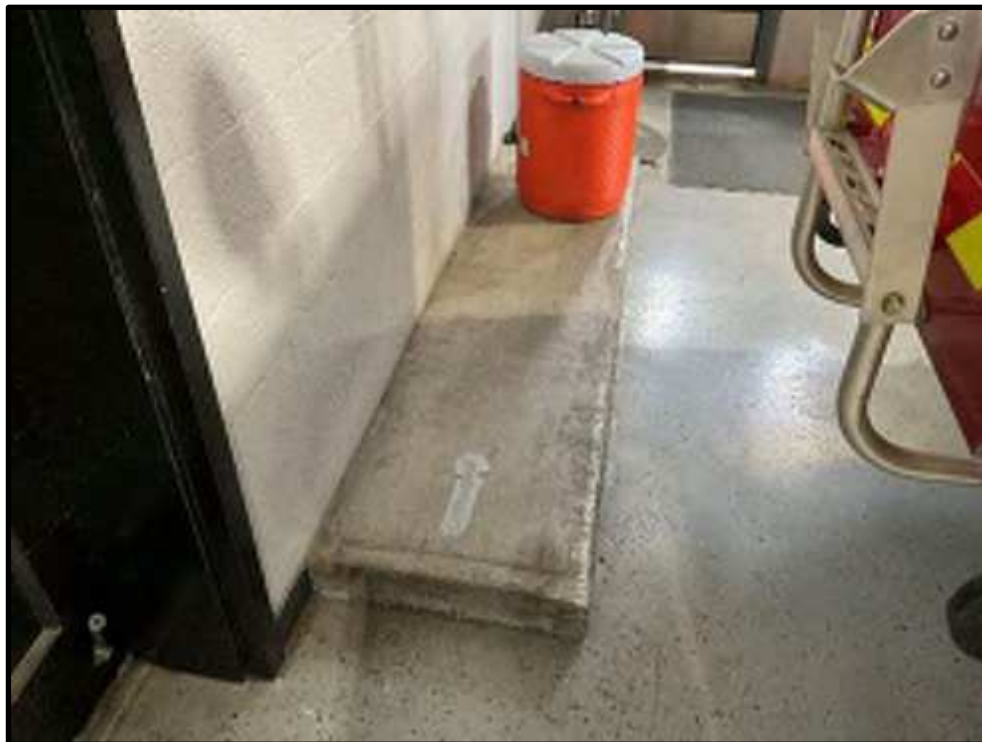
16 - B201 Locker Curb