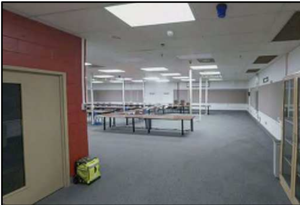
86 - B216 NW Secure Area North Wall