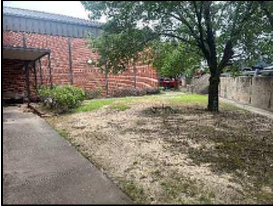
77 - B216 Area of Addition