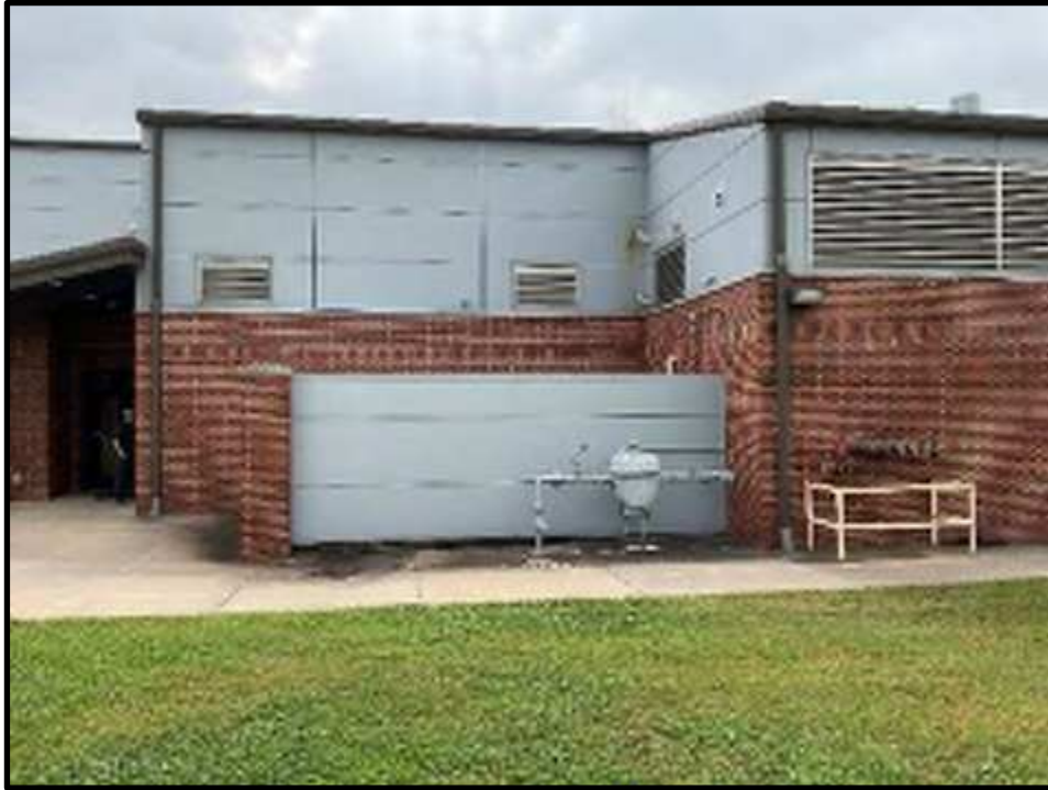
51 - B202 Utility Enclosure