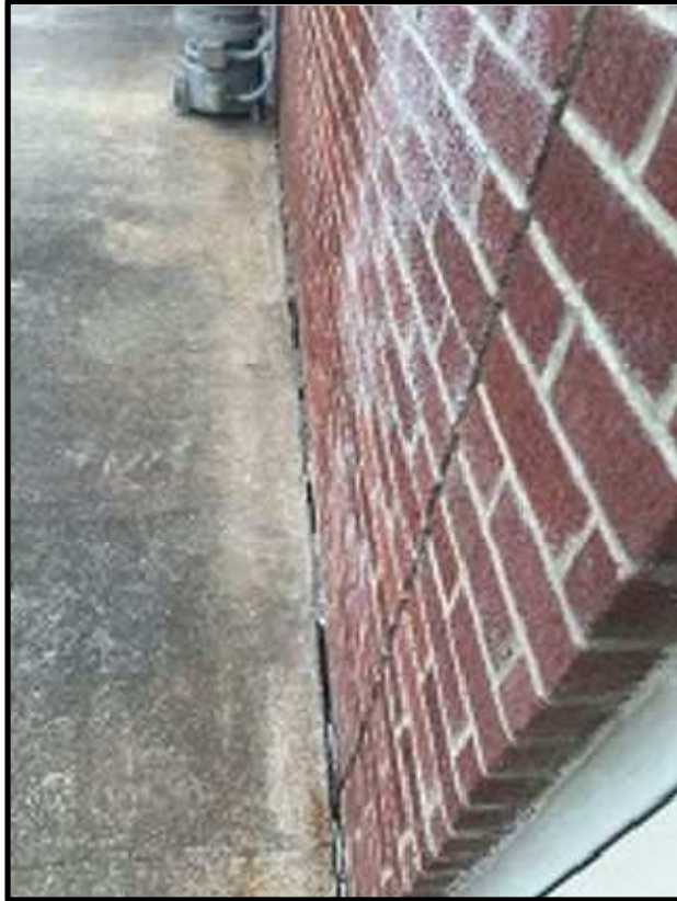
59 - B214 Expansion Joint