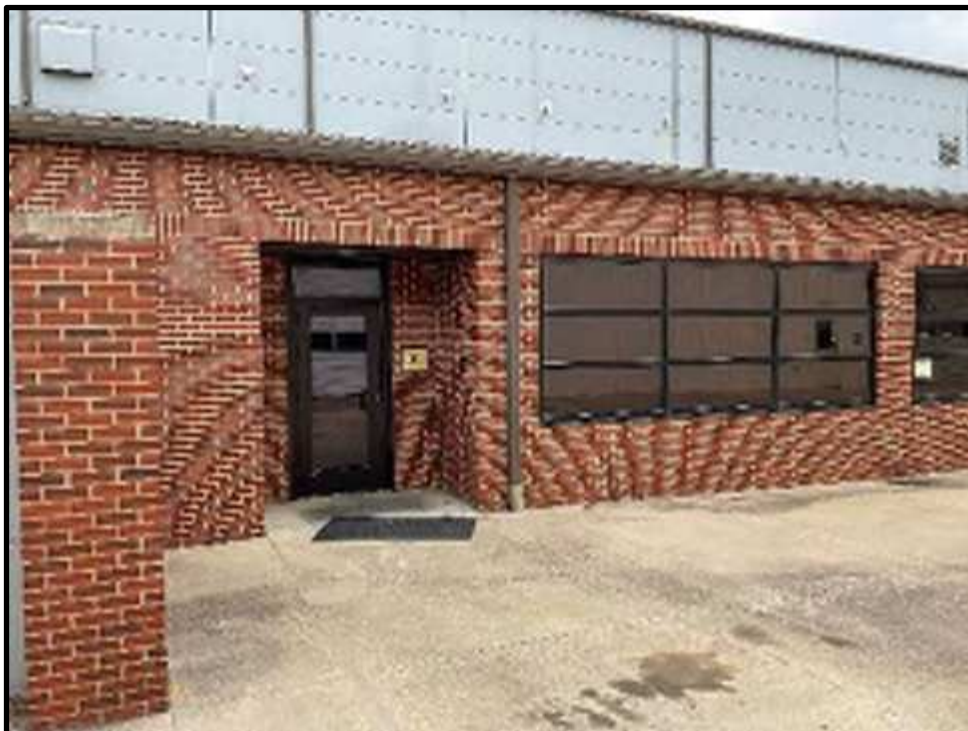
22 - B202 East Entry on North Side of Building