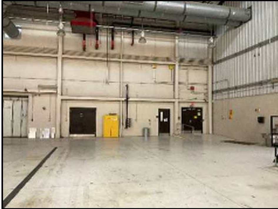
43 - B202 Hangar Bay 3 North Wall East Side