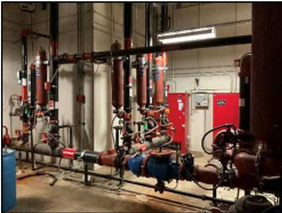
38 - B202 Fire Riser Room #2