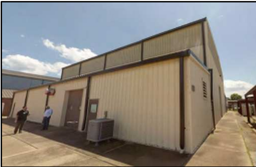
58 - B214 Exterior View #4