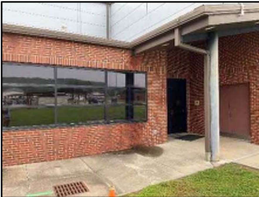
18 - B202 Covered Personnel Entry