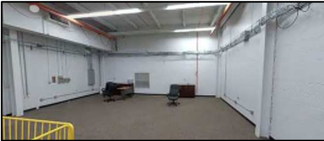
90 – B216 Secure Area North Wall