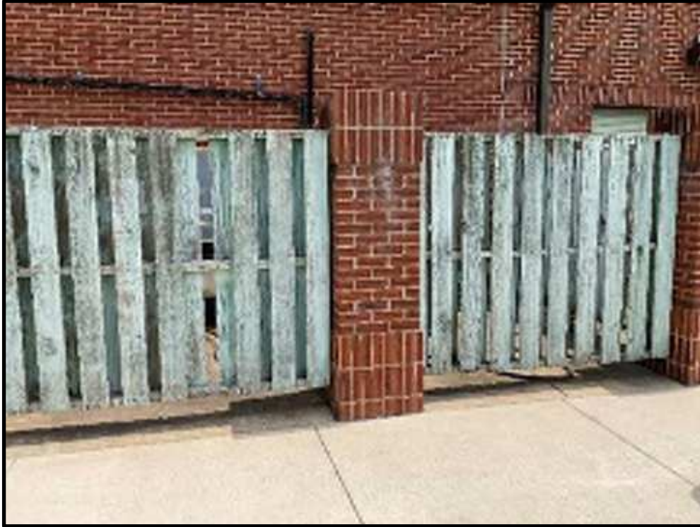
7 - B201 Utility Enclosure #1