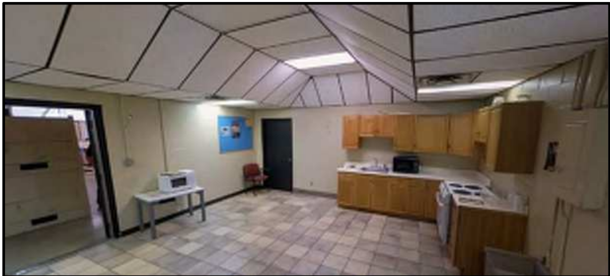
64 - B214 Breakroom