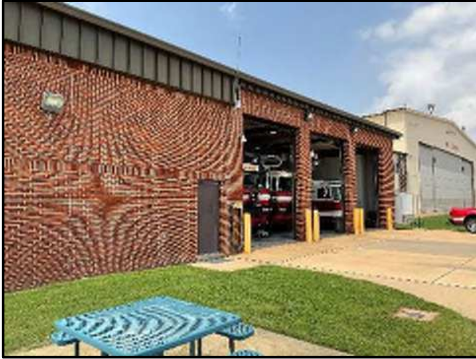
5 - B202 East Overhead Door Openings