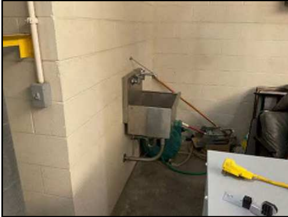
45 - B202 Hangar Bay 3 Tyre Sink