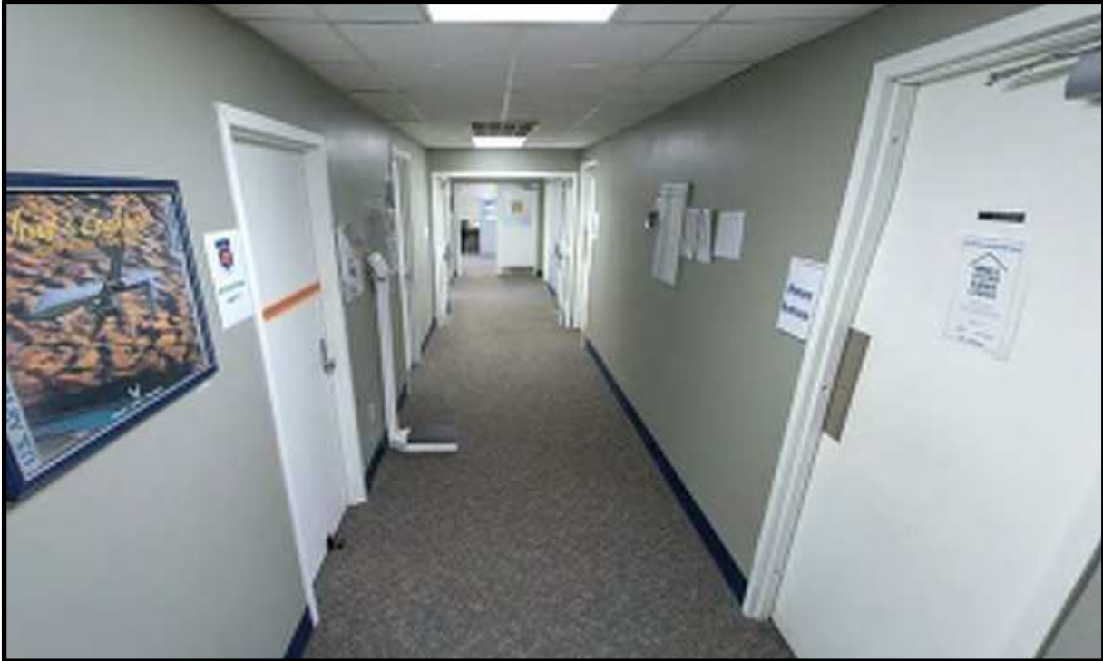
102 - B218 Hall #2