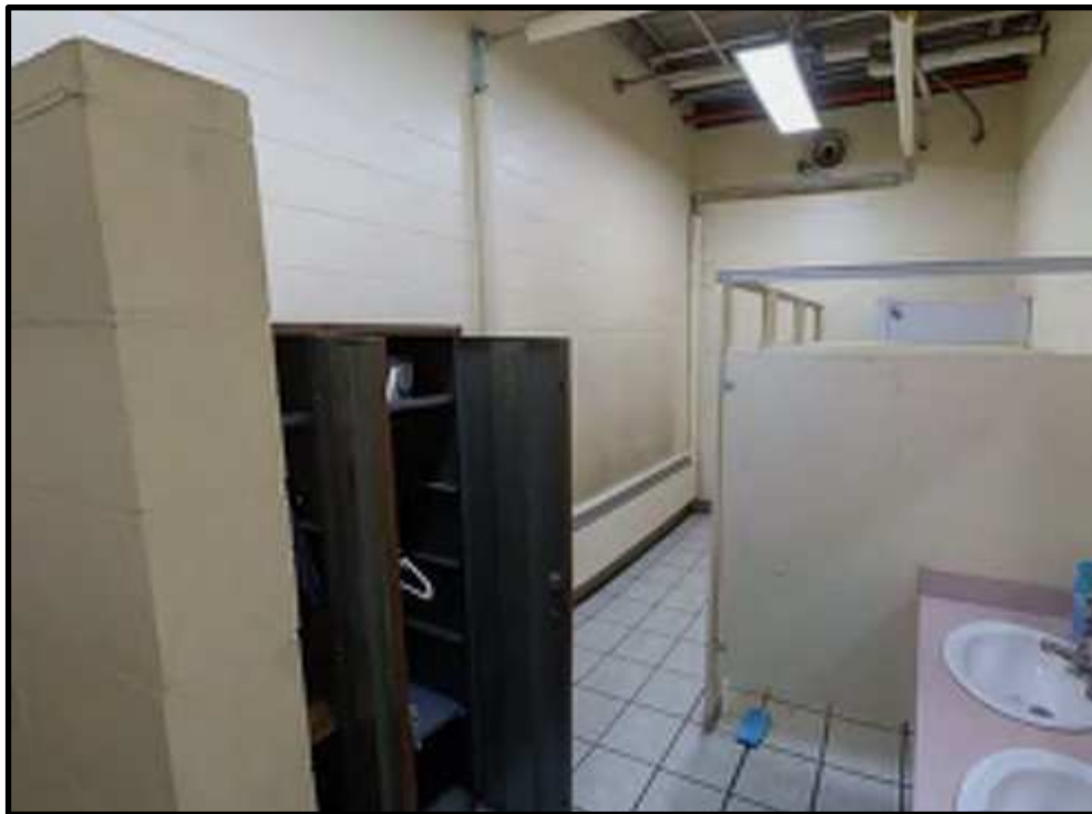
68 - B214 Restroom