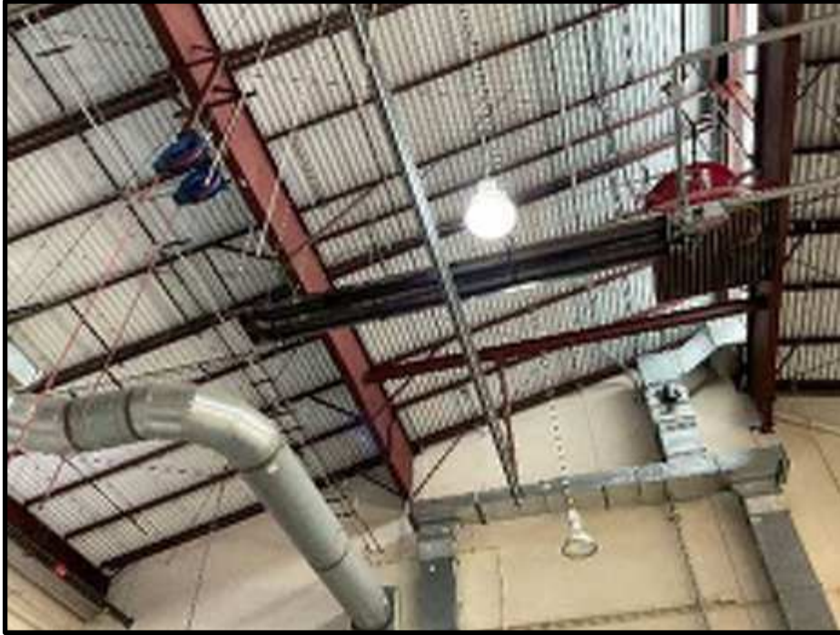
41 - B202 Hangar Bay 2 Ceiling