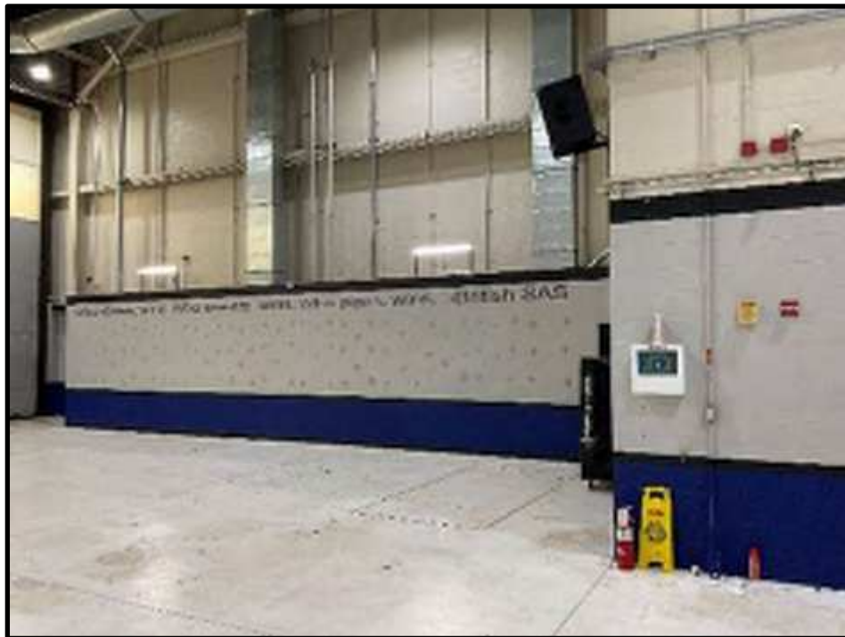
48 - B202 Screen Wall to be Removed, Typical