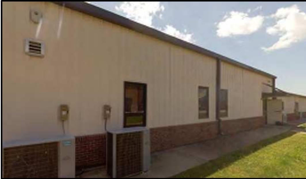
94 - B218 Exterior View #3