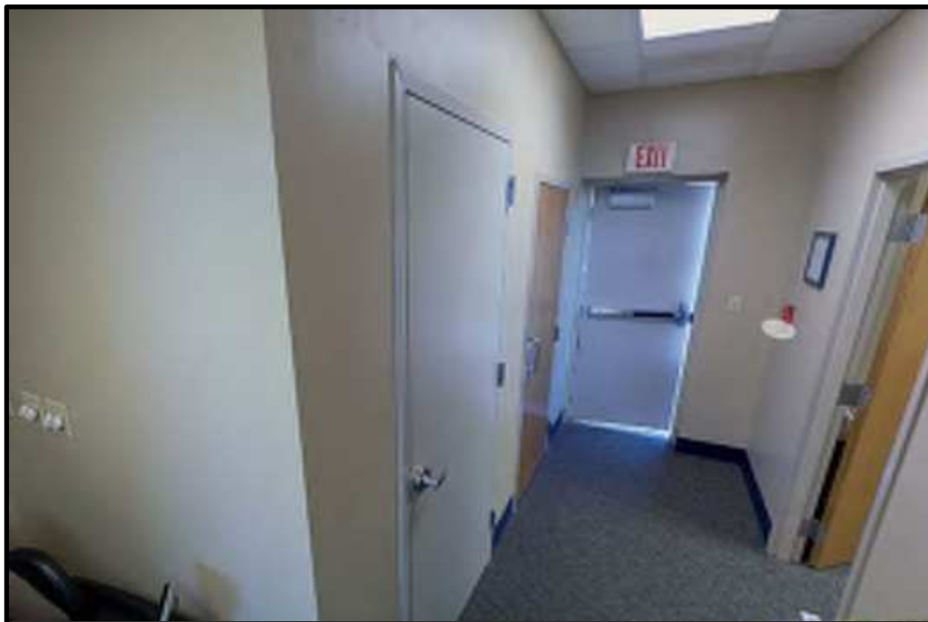
97 - B218 Comm Equipment at Entry