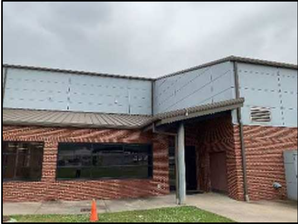
19 - B202 Main Entry