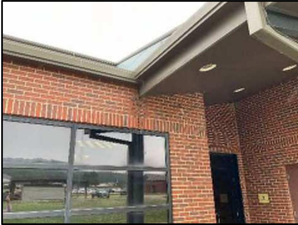
21 - B202 Water Damage at Covered Entry