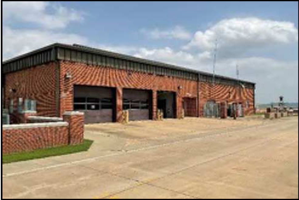
3 - B201 South Facade