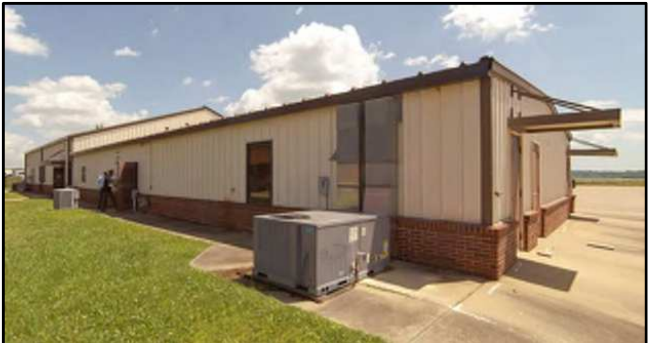
93 - B218 Exterior View #2