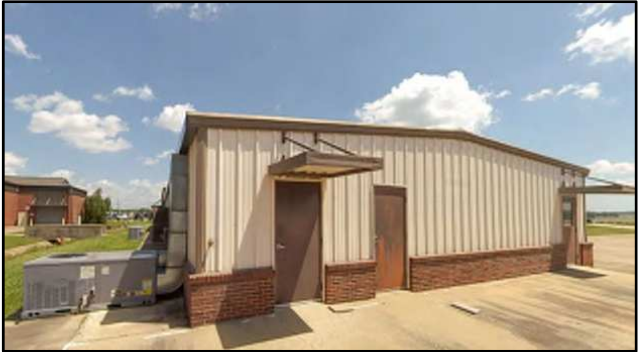
92 - B218 Exterior View #1