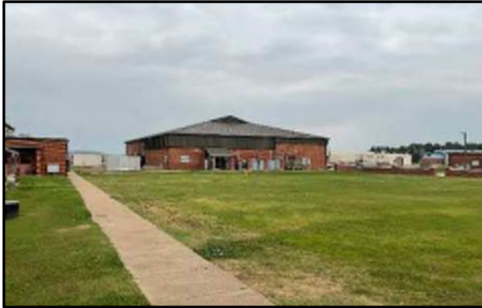
1 - B201 Exterior from Northeast