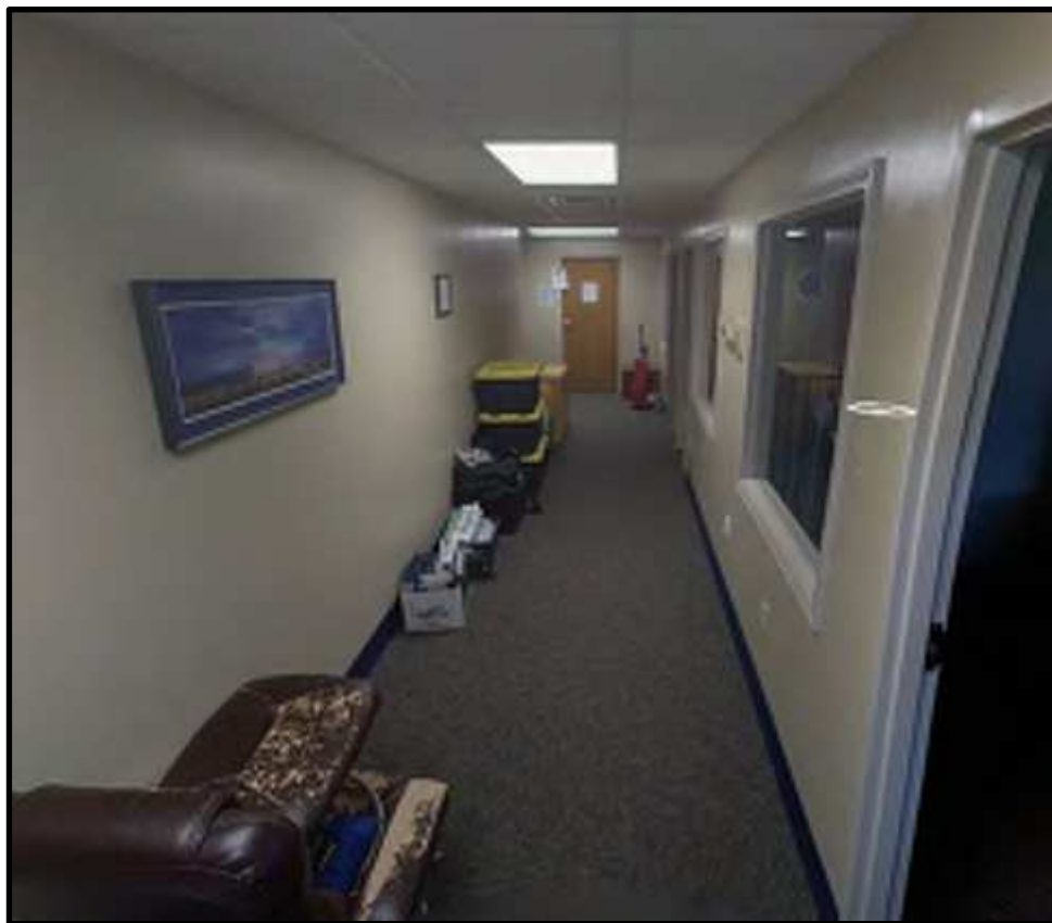
101 - B218 Hall #1