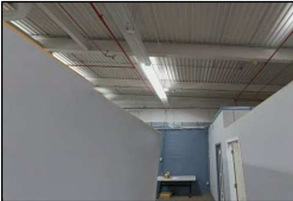
82 - B216 F35 Area North View