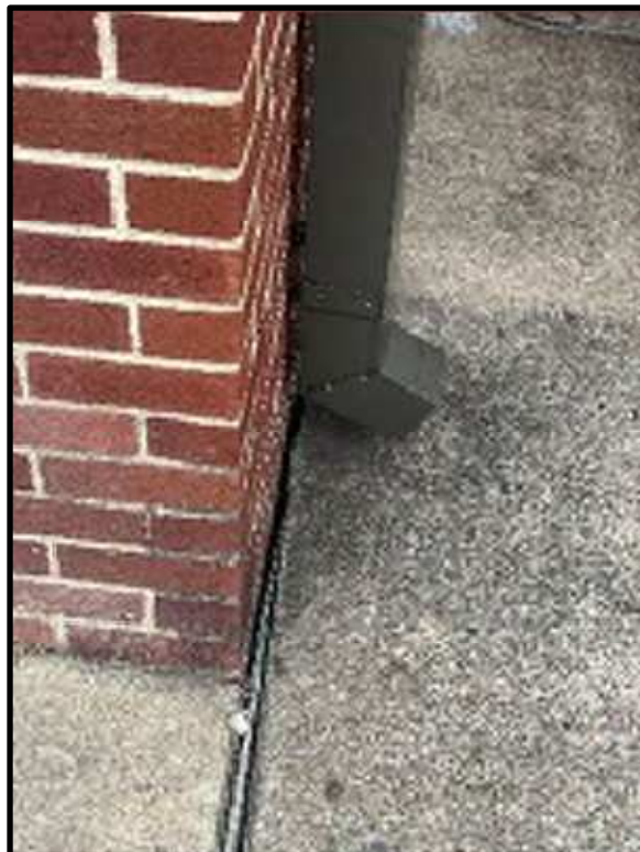
10 - B201 Expansion Joint