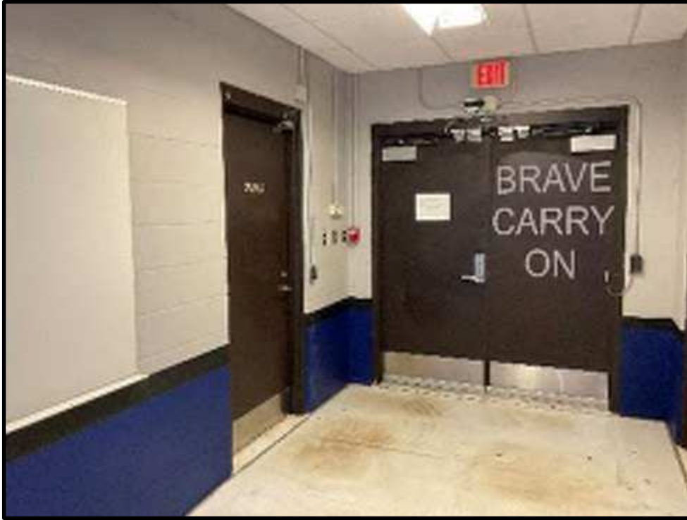
29 - B202 Bay 1 Door to be Removed