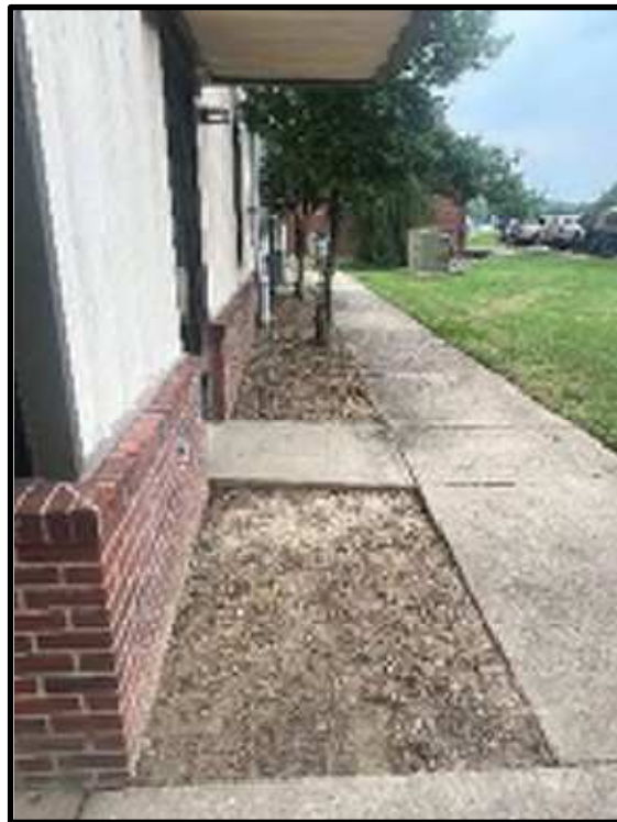
95 - B218 North Side Planting Bed