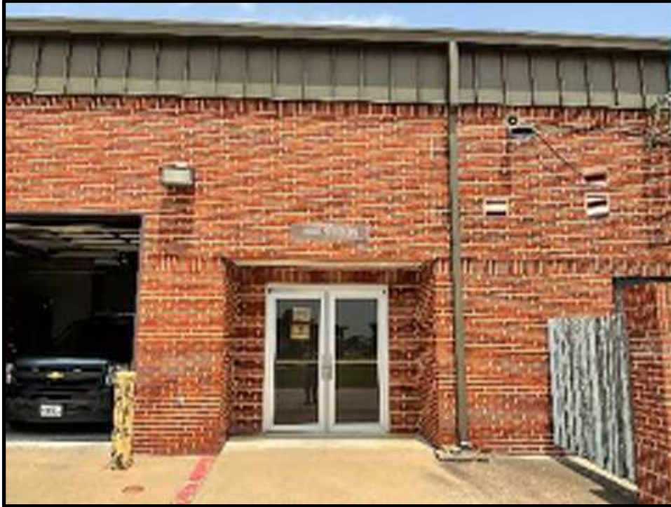
11 - B201 Infill South Doors