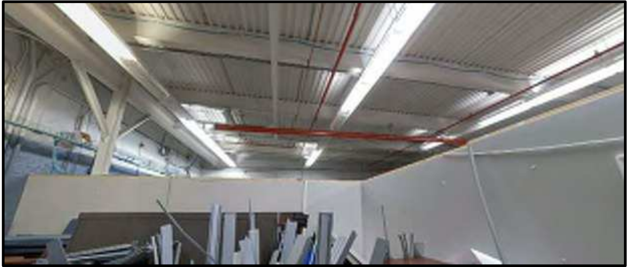
83 - B216 F35 Area North View #2