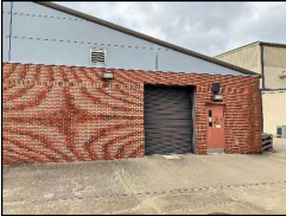
23 - B202 Exterior Tank Bay Doors