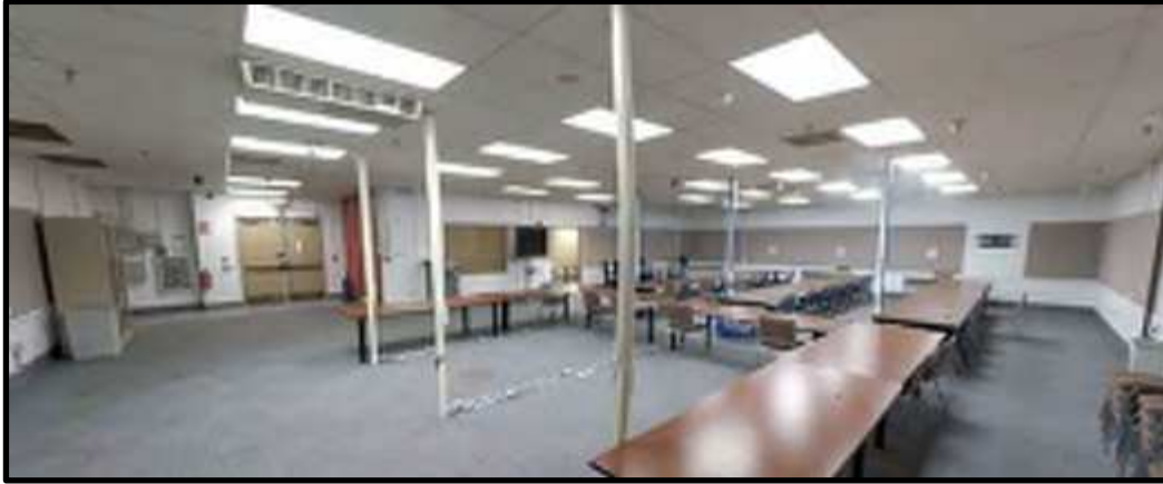
89 – B216 NW Secure Area West Wall