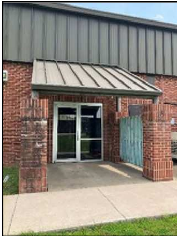
4 - B201 Covered Entry Brick Deterioration