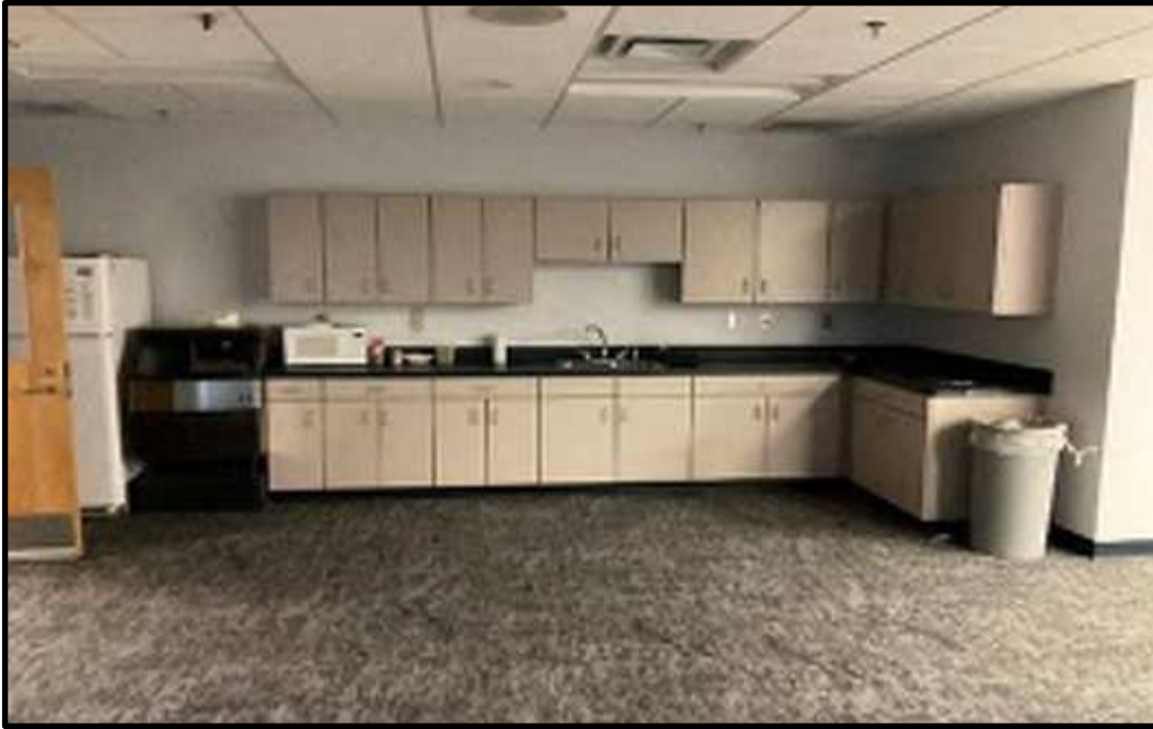
33 - B202 Existing Kitchenette