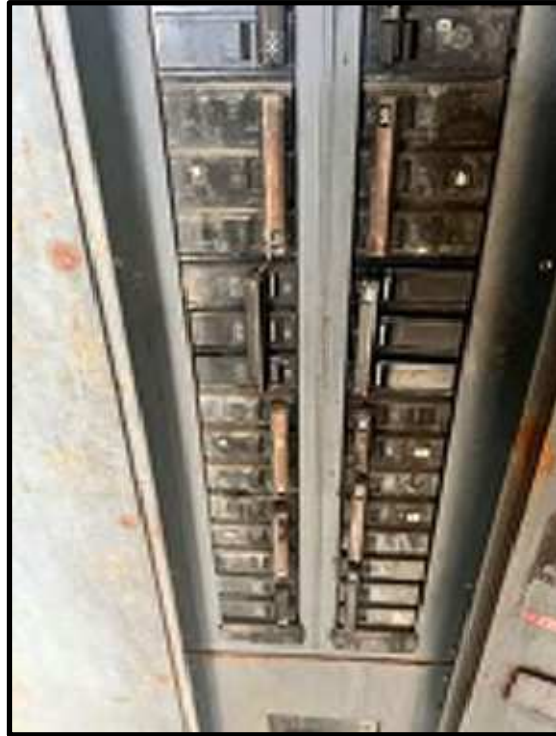
63 - B214 Old Electrical Panel