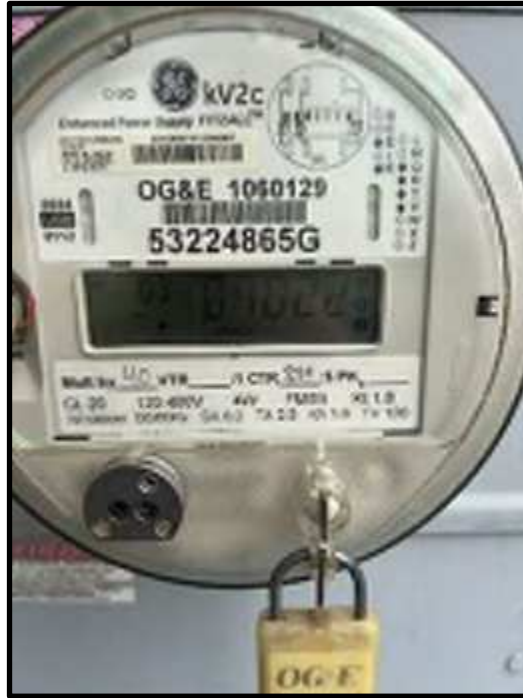
96 - B218 Meter