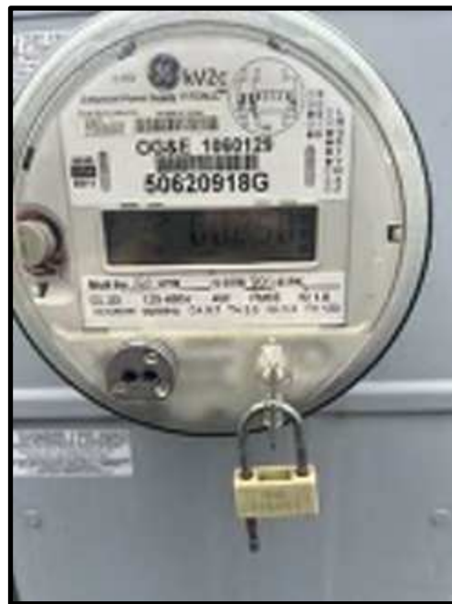
53 - B202 Meter