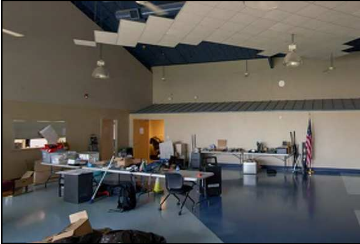
98 - B218 Assembly Area View #1