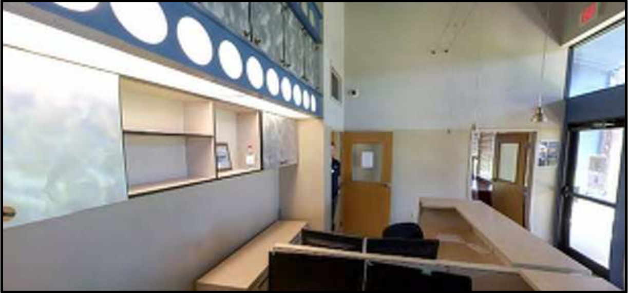
104 - B218 Office #1