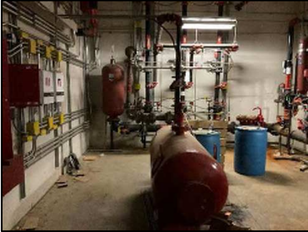
37 - B202 Fire Riser Room #1