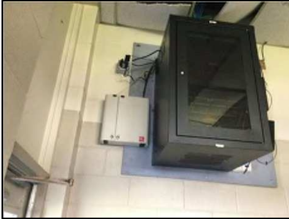
61 - B214 Comm Device #1