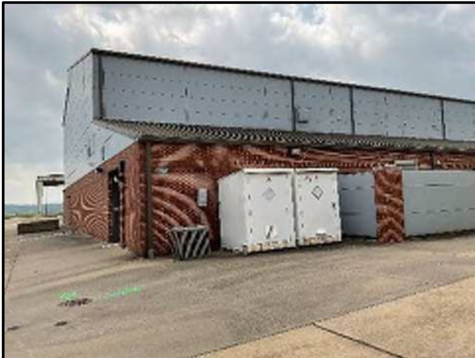
24 - B202 Northeast Corner