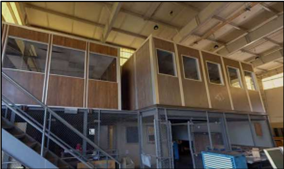
66 - B214 Mezzanine #1