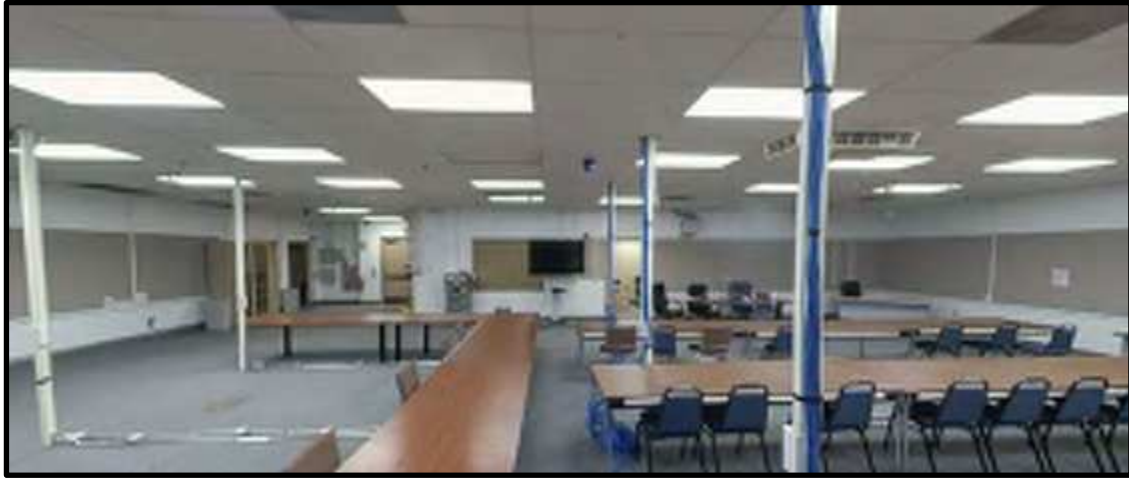
87 - B216 NW Secure Area South Wall