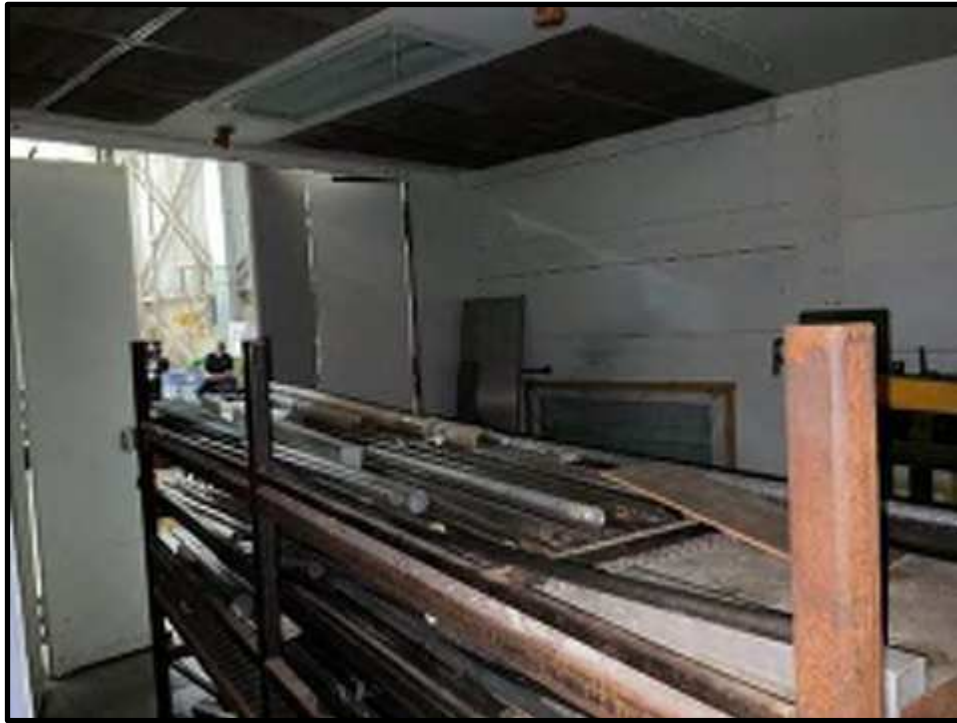
47 - B202 Paint Booth Interior