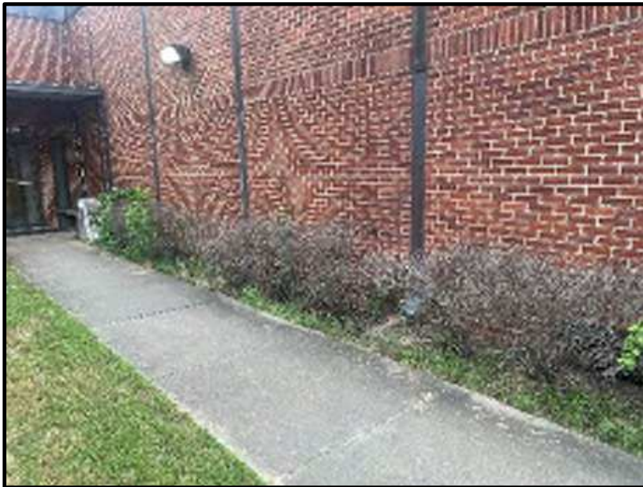
78 - B216 Downspouts by Addition