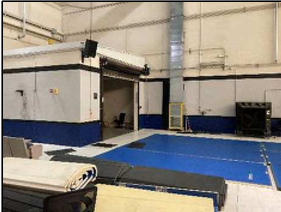
42 - B202 Hangar Bay 3 Handwash