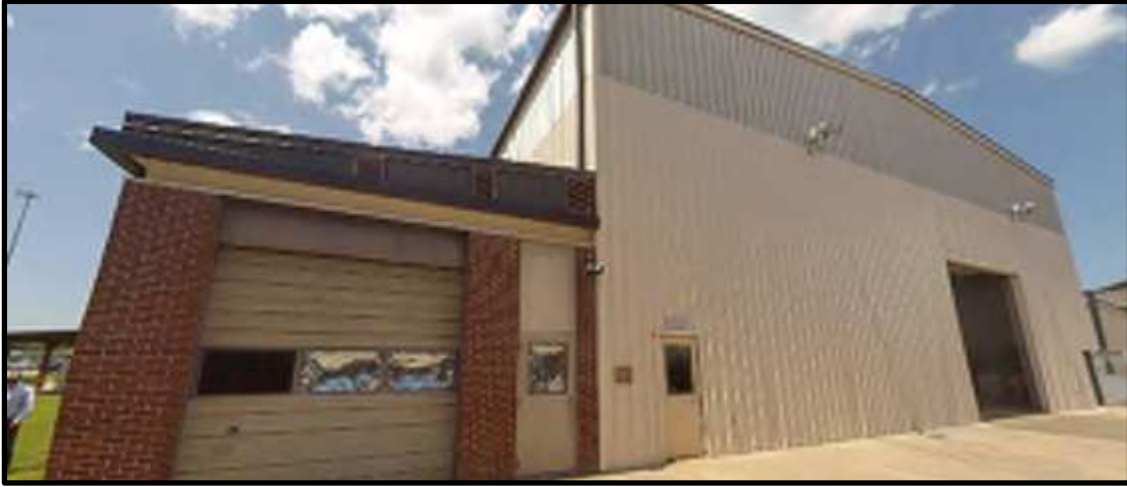
55 - B214 Exterior View #1