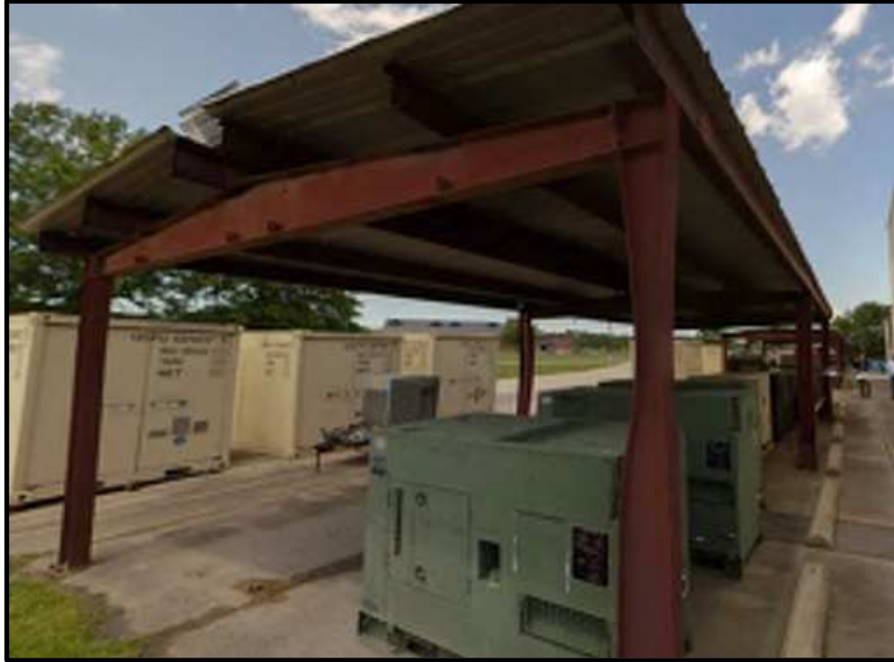
57 - B214 Exterior View #3