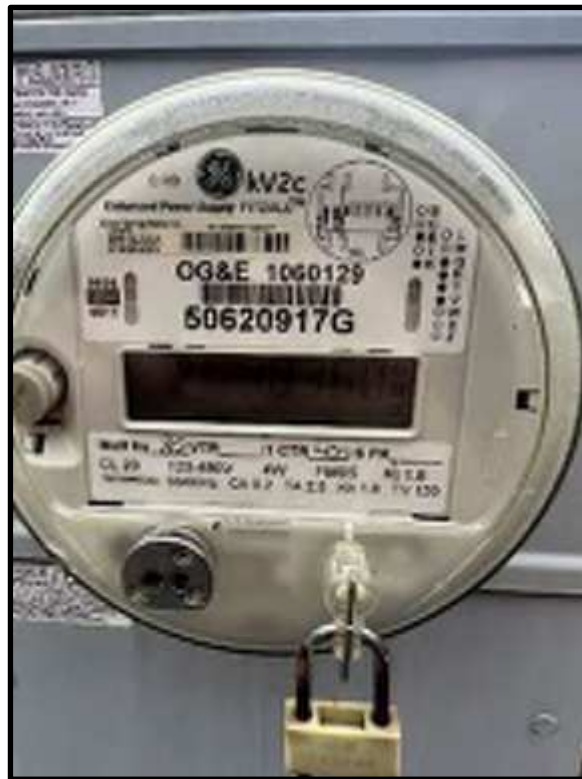
80 - B216 Meter