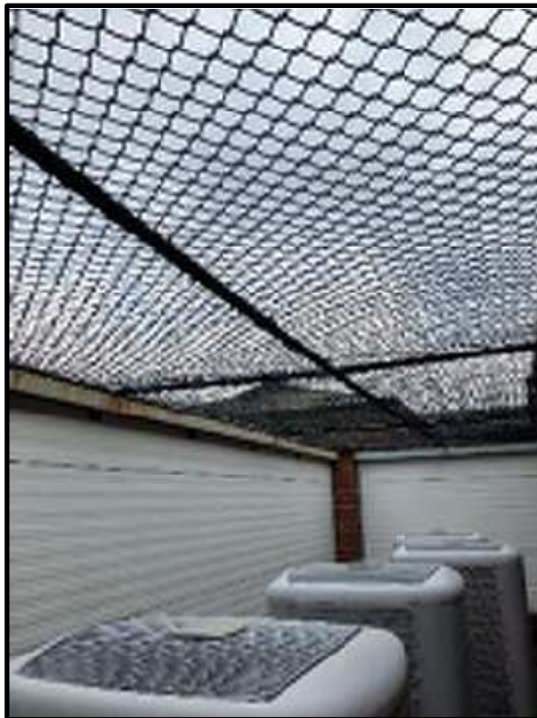
50 - B202 Utility Enclosure