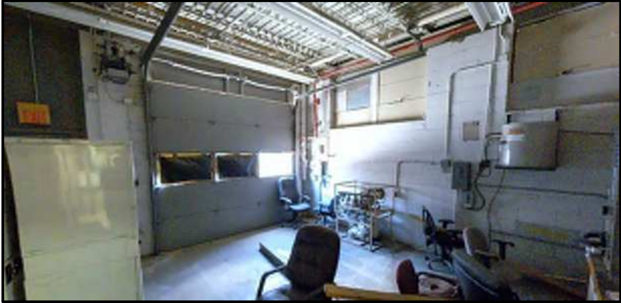
71 - B214 Storage Area #3