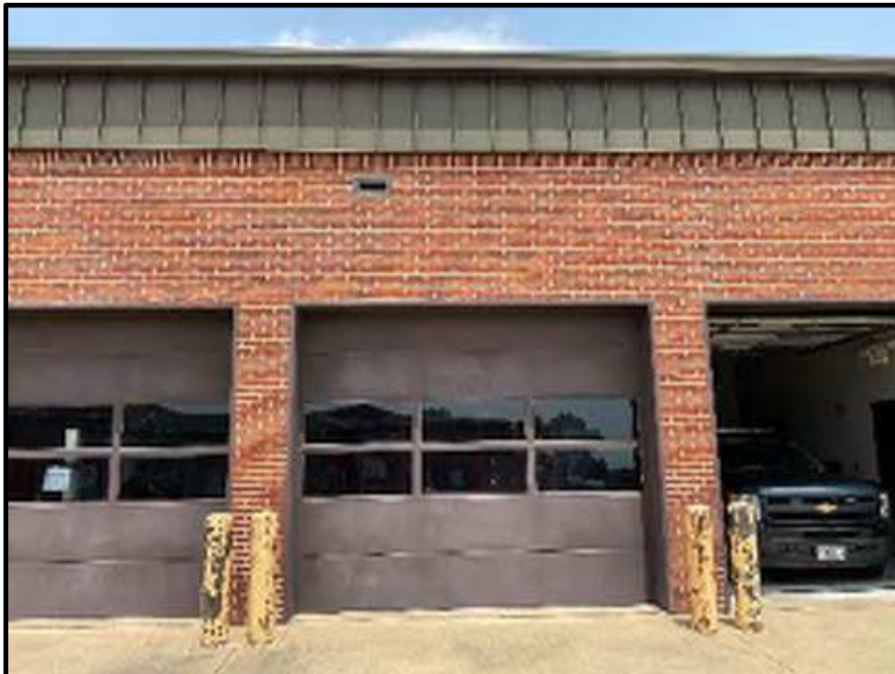
6 - B201 Infill South Doors