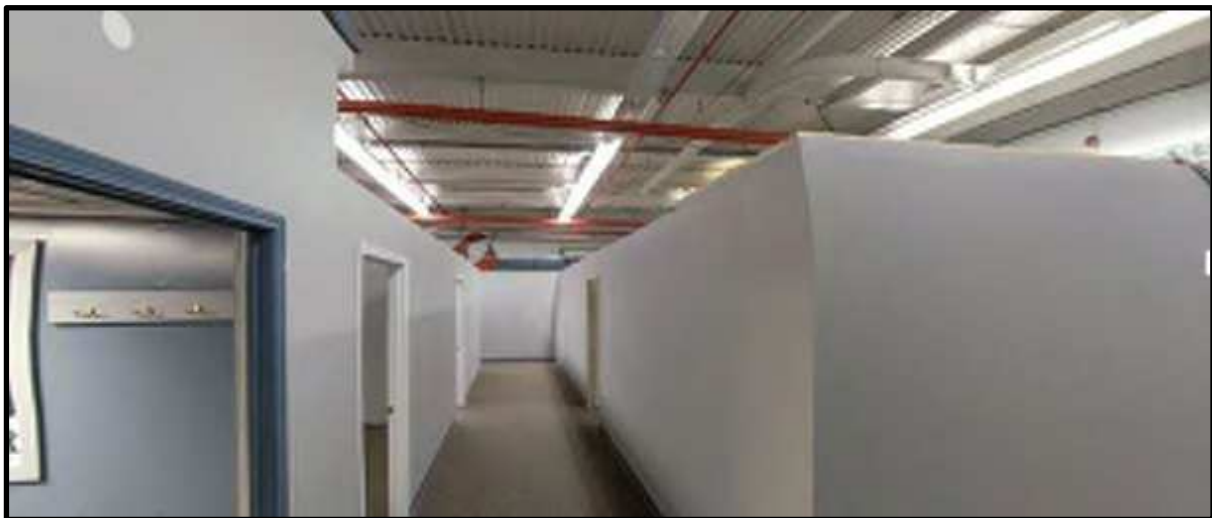
84 - B216 F35 Area South View