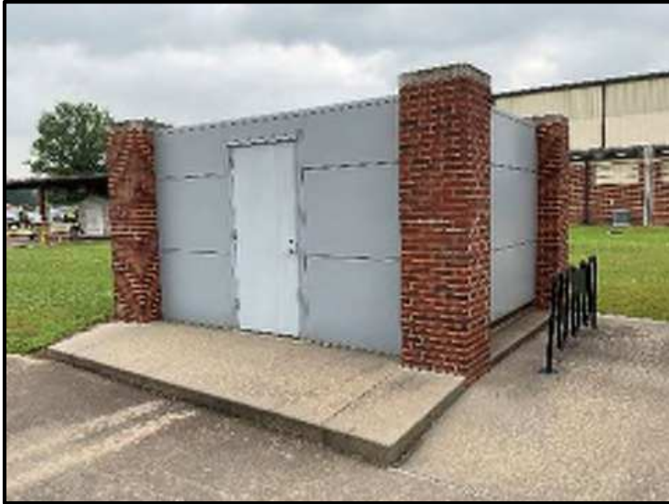
27 - B202 Transformer Enclosure