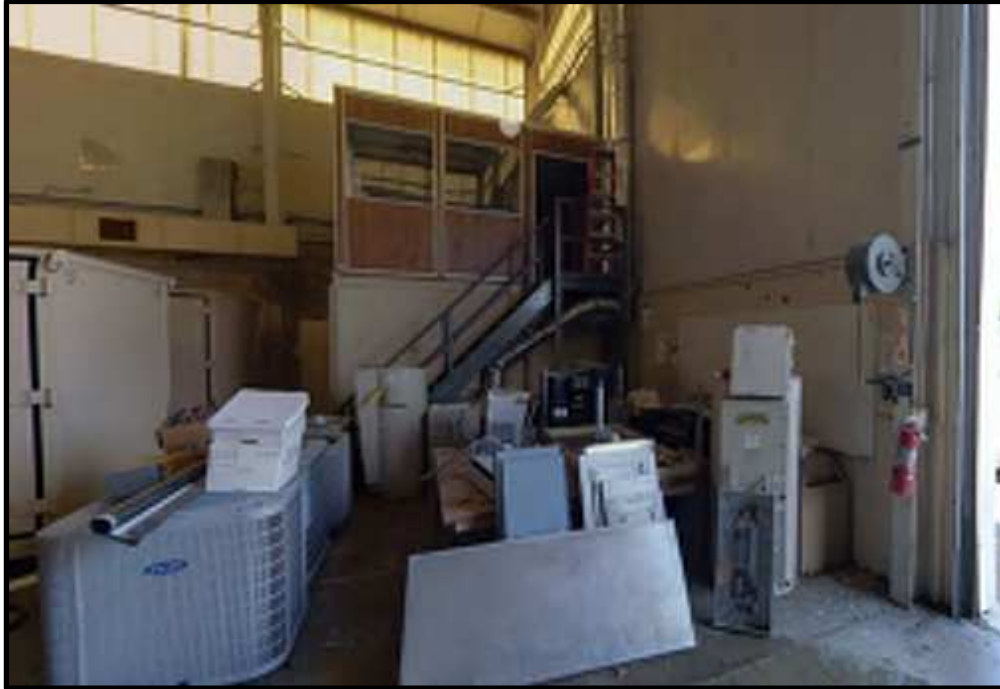
67 - B214 Mezzanine #2