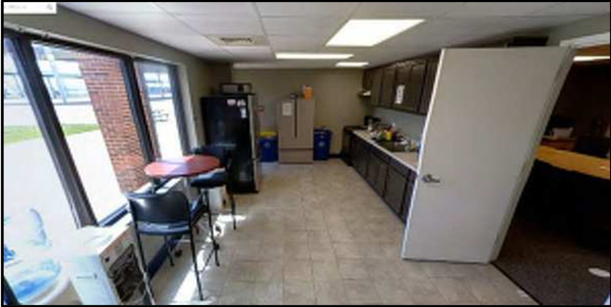
100 - B218 Breakroom