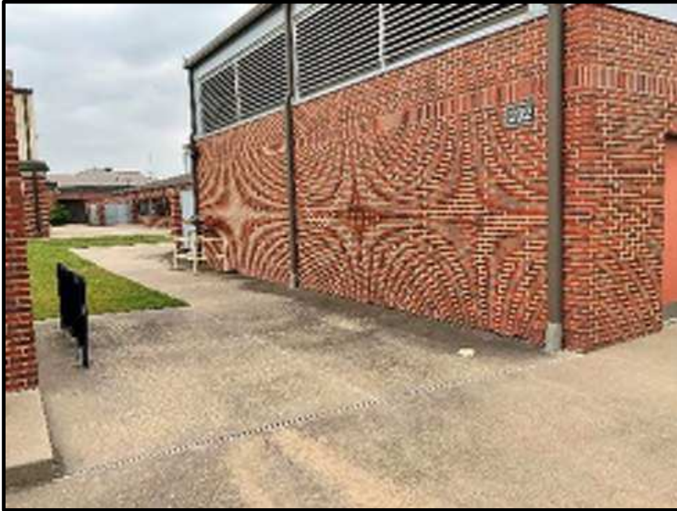
25 - B202 Northwest Corner