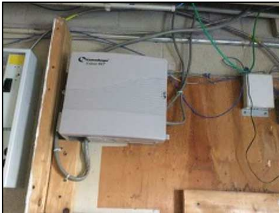
62 - B214 Comm Device #2