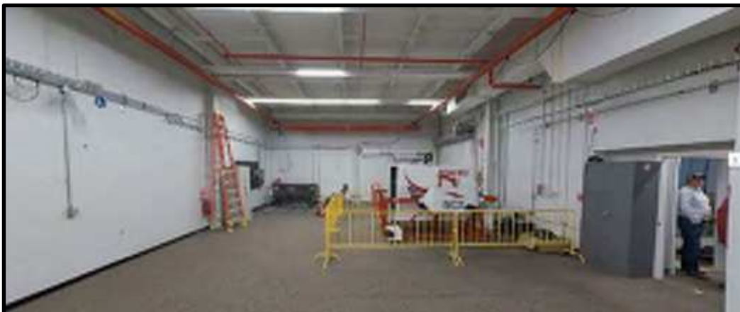
91 – B216 Secure Area South Wall