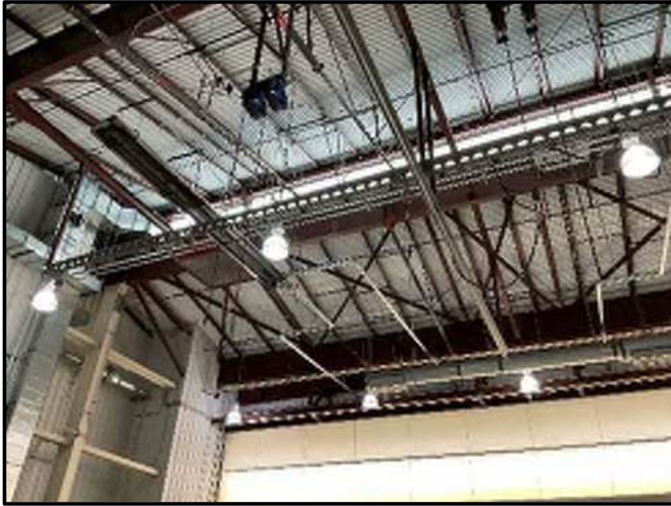
31 - B202 Existing Hangar Bay Ceiling