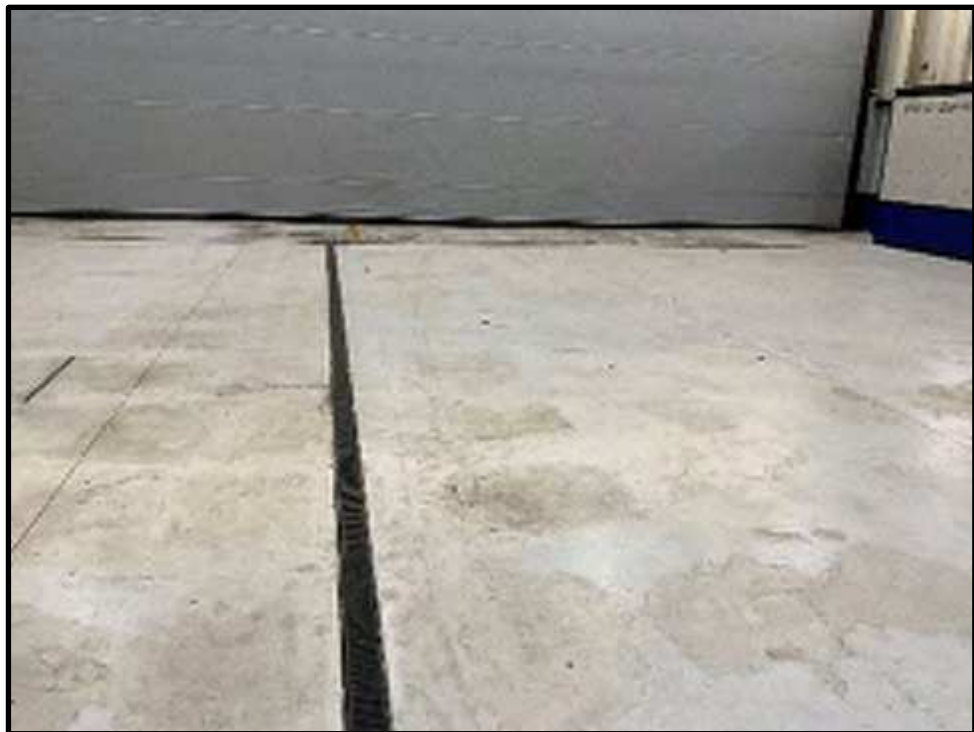
32 -B202 Existing Hangar Bay Epoxy Floor