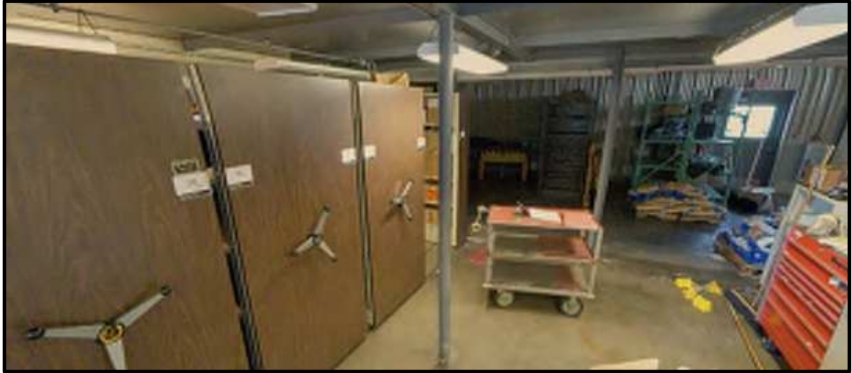
69 - B214 Storage Area #1