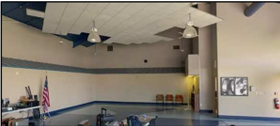
99 - B218 Assembly Area View #2