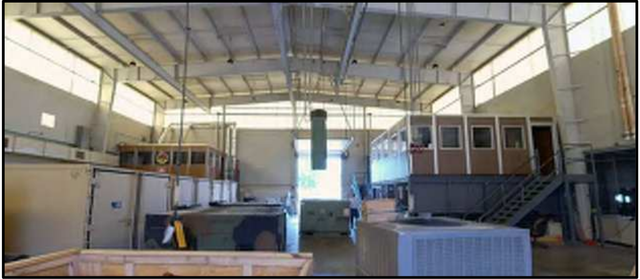
73 - B214 Work Bay View #1