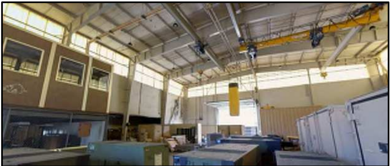
74 - B214 Work Bay View #2