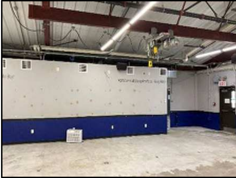
49 - B202 Tank Bay Screen Wall to be Removed