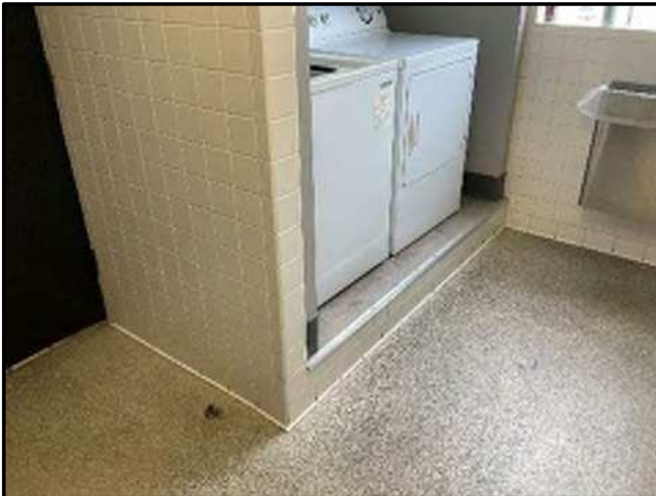
12 - B201 Washer and Dryer Curb