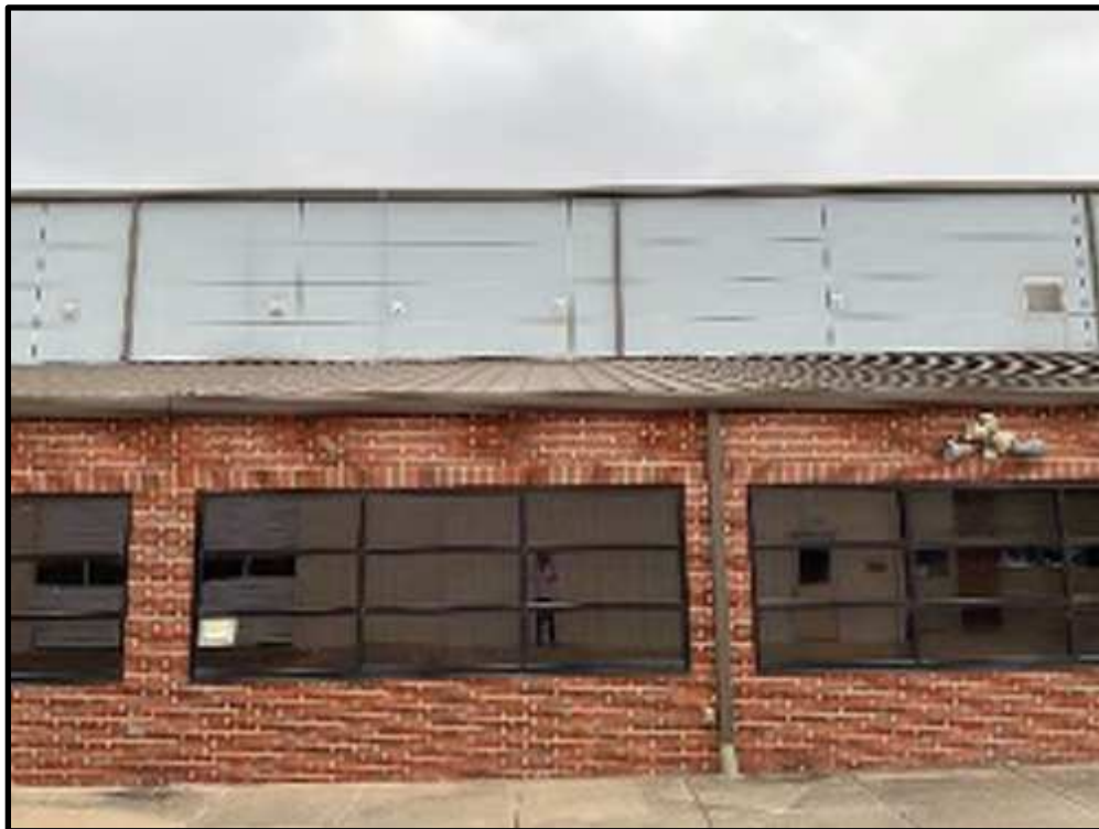
20 - B202 Existing Storefront Windows