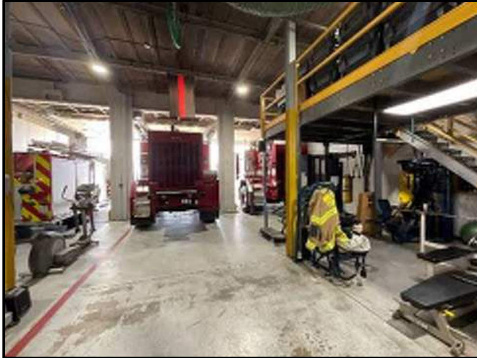
15 - B201 Equipment Bay and Mezzanine