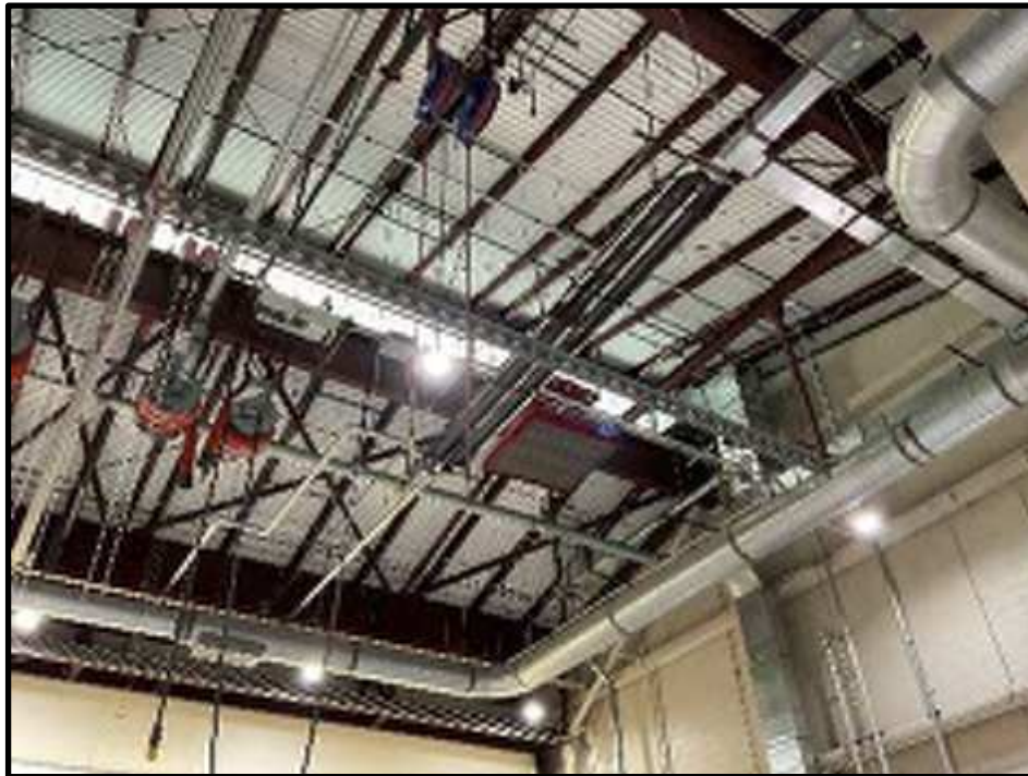
28 - B202 Bay 1 Ceiling