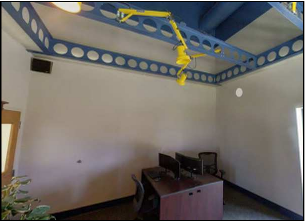
105 - B218 Office #2