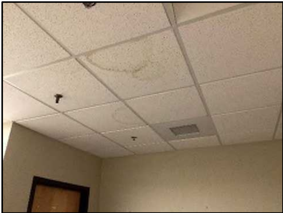
30 - B202 Example of ACT Damage