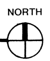
A COMMUNICATION PLAN SCALE: 1/8" : 1'-0"

REF:SEE SHT. E-2 FOR ELECT. NOTES & LEGEND. SEE SHT. E-5 FOR ELECT SCHEDULES, DETAILS & RISERS