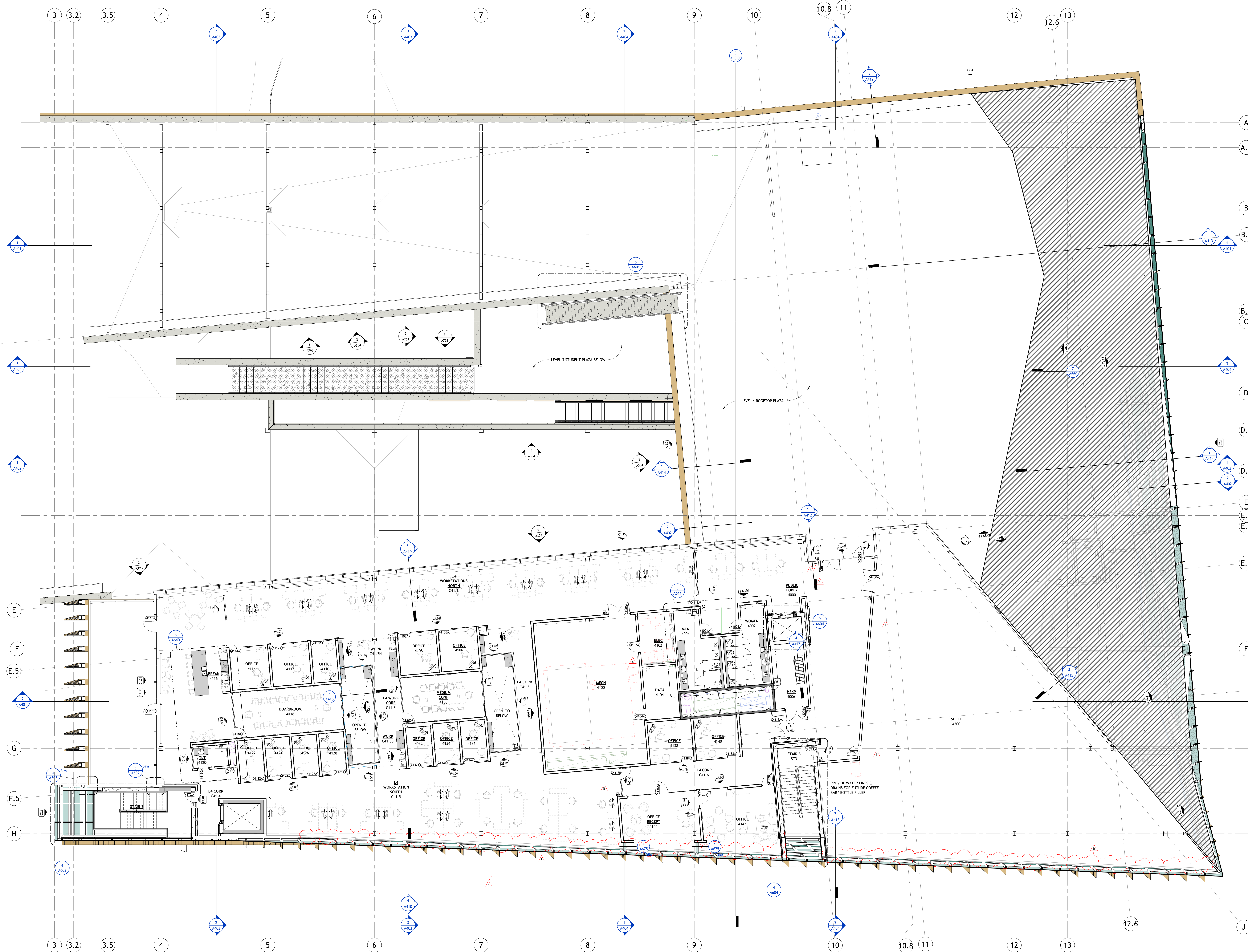
1 | L4 - 1/8" NOTE PLAN - AREA A 1/8" = 1'-0"