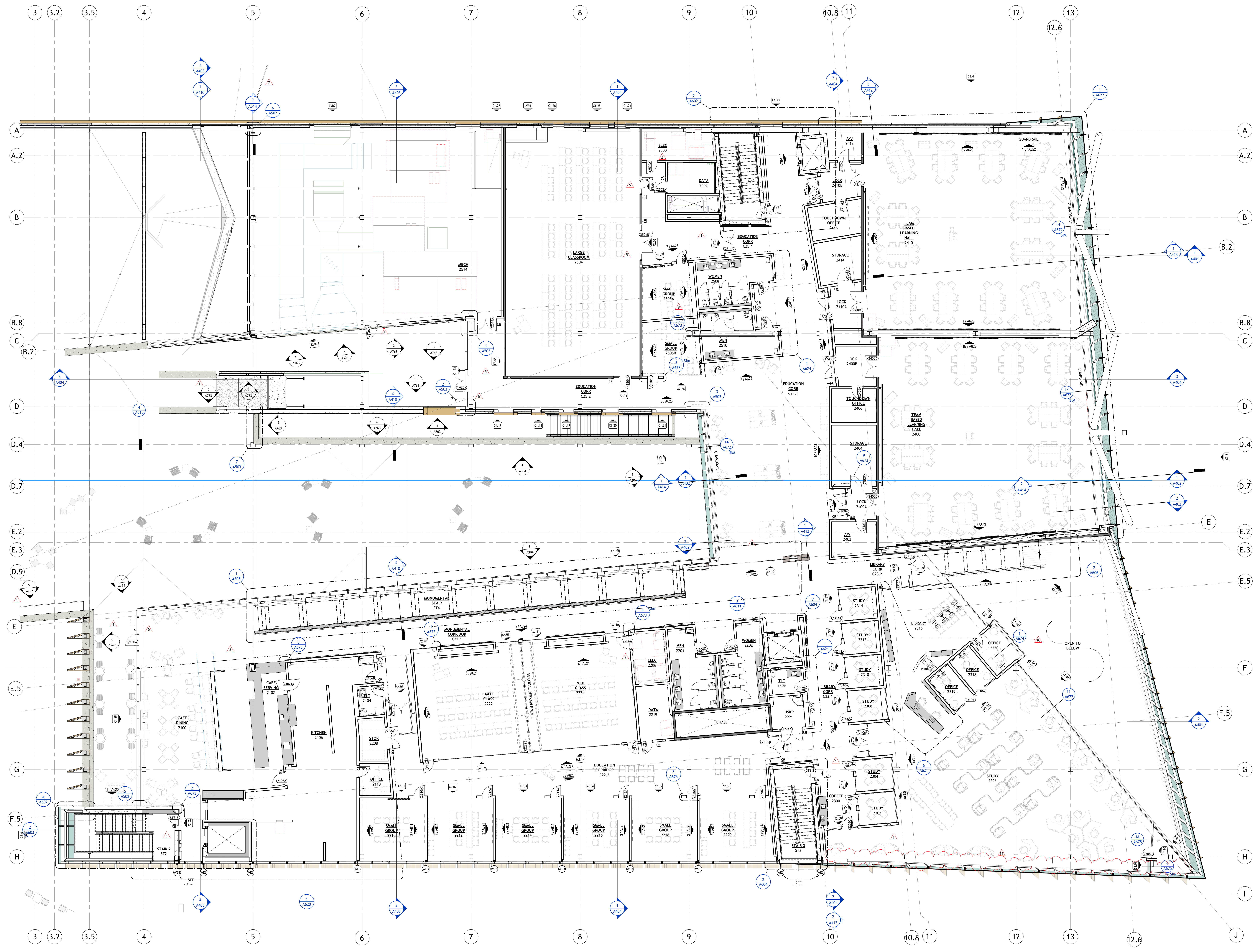
1 | L2 - 1/8" NOTE PLAN, AREA A 1/8" = 1'-0"